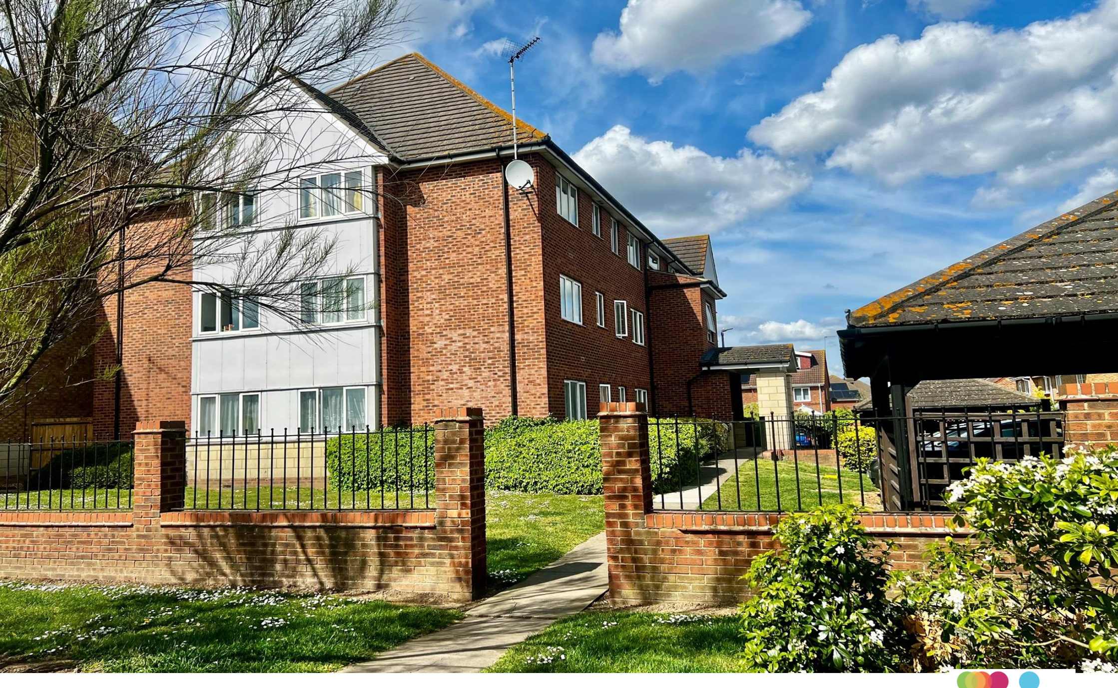
St. Leonards Close, Grays RM17 6GT