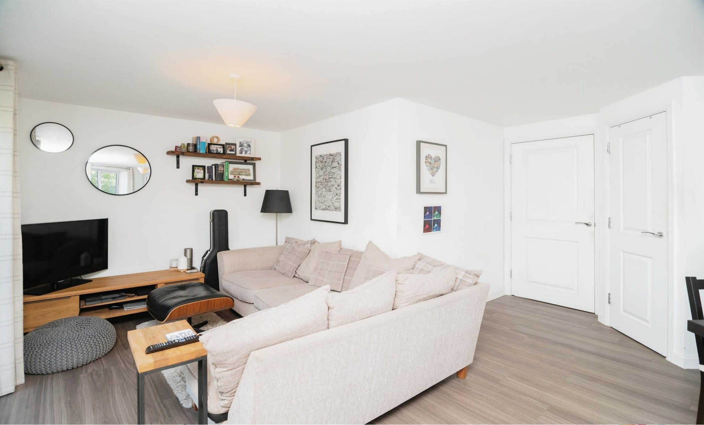
The Chase, Grays RM20 4BF