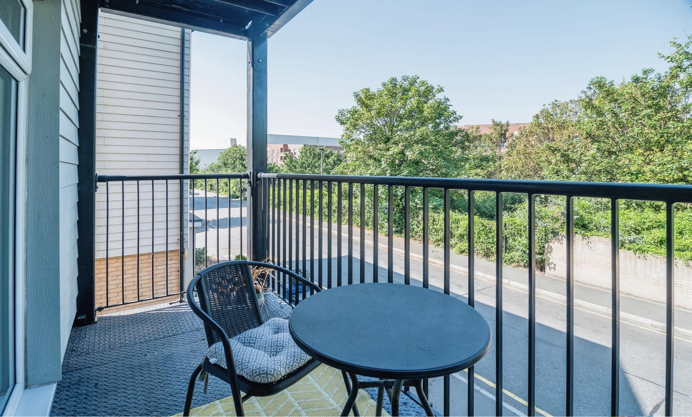
The Chase, Grays RM20 4BF