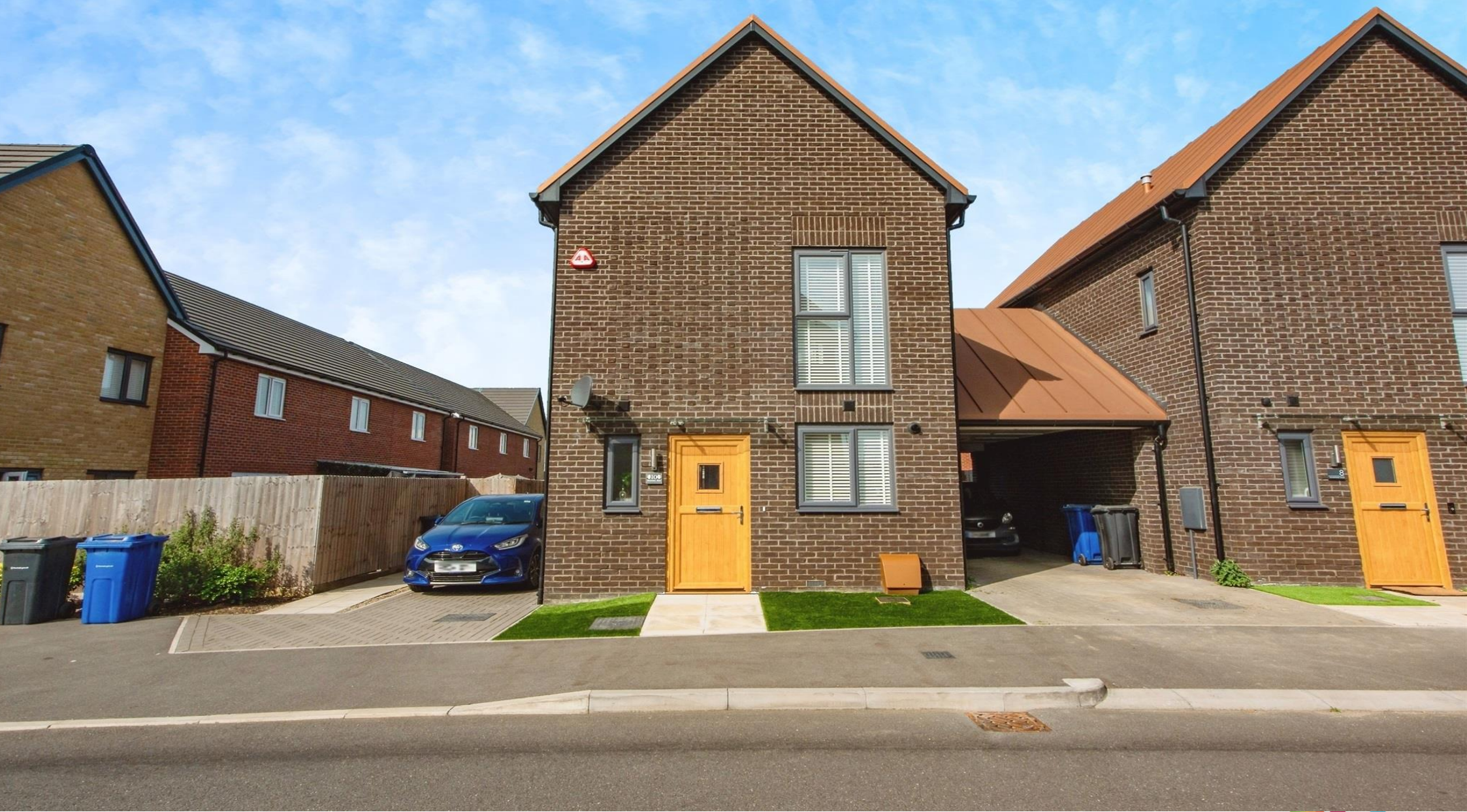
Dovestone Close, West Thurrock, Grays RM20 3DG