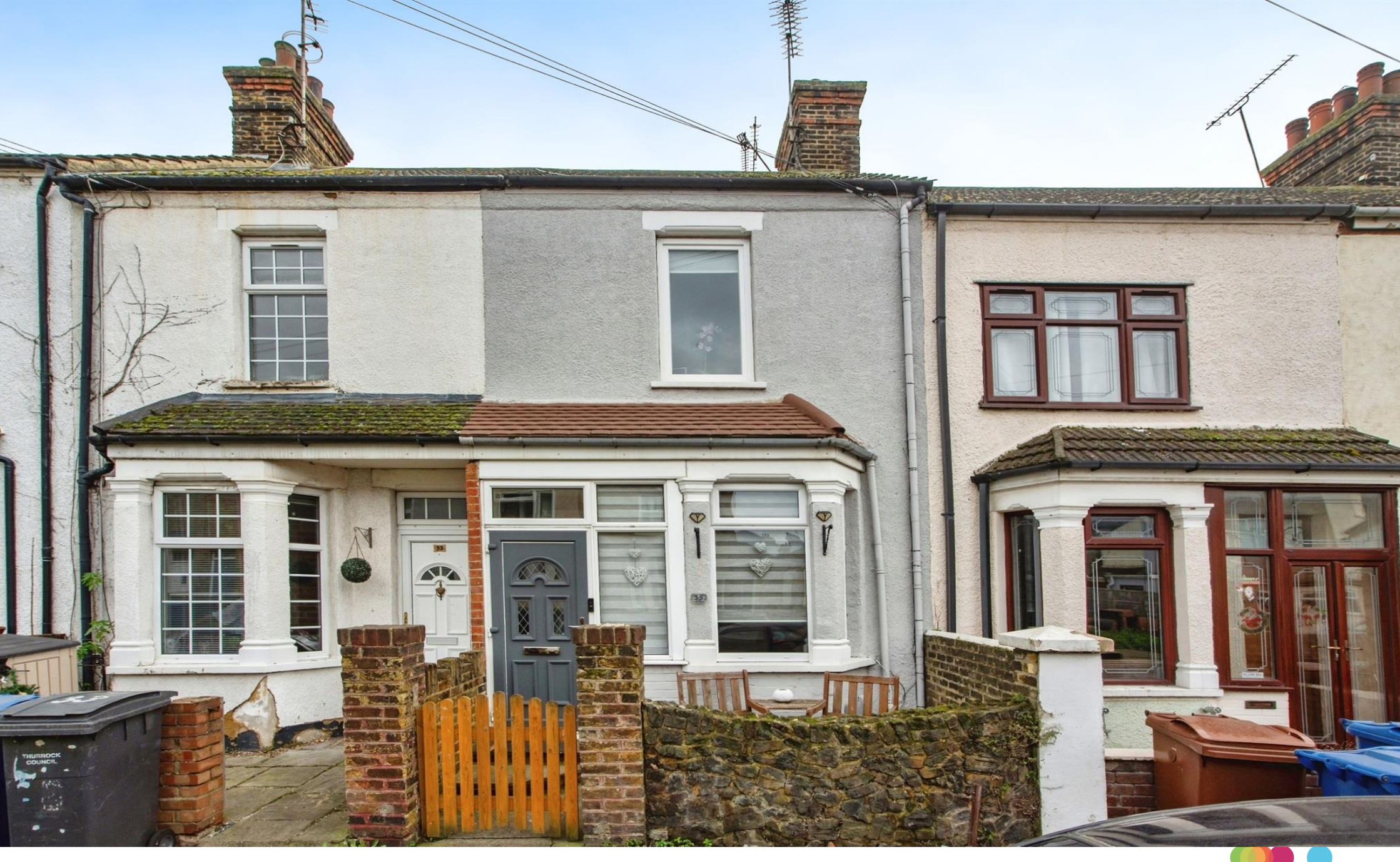
Oak Road, Grays RM17 6JX