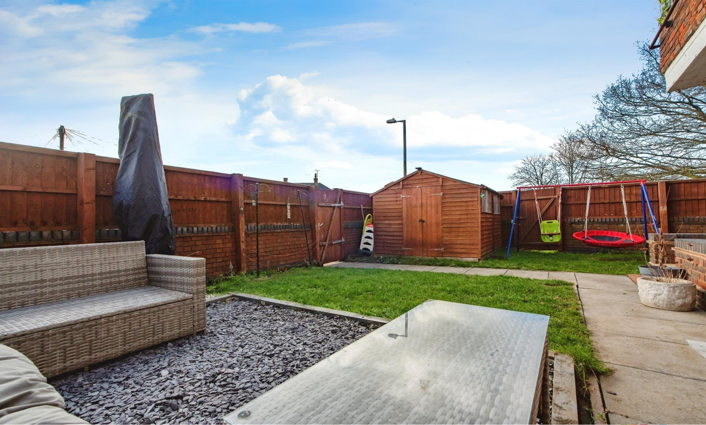
Faymore Gardens, South Ockendon RM15 5NW