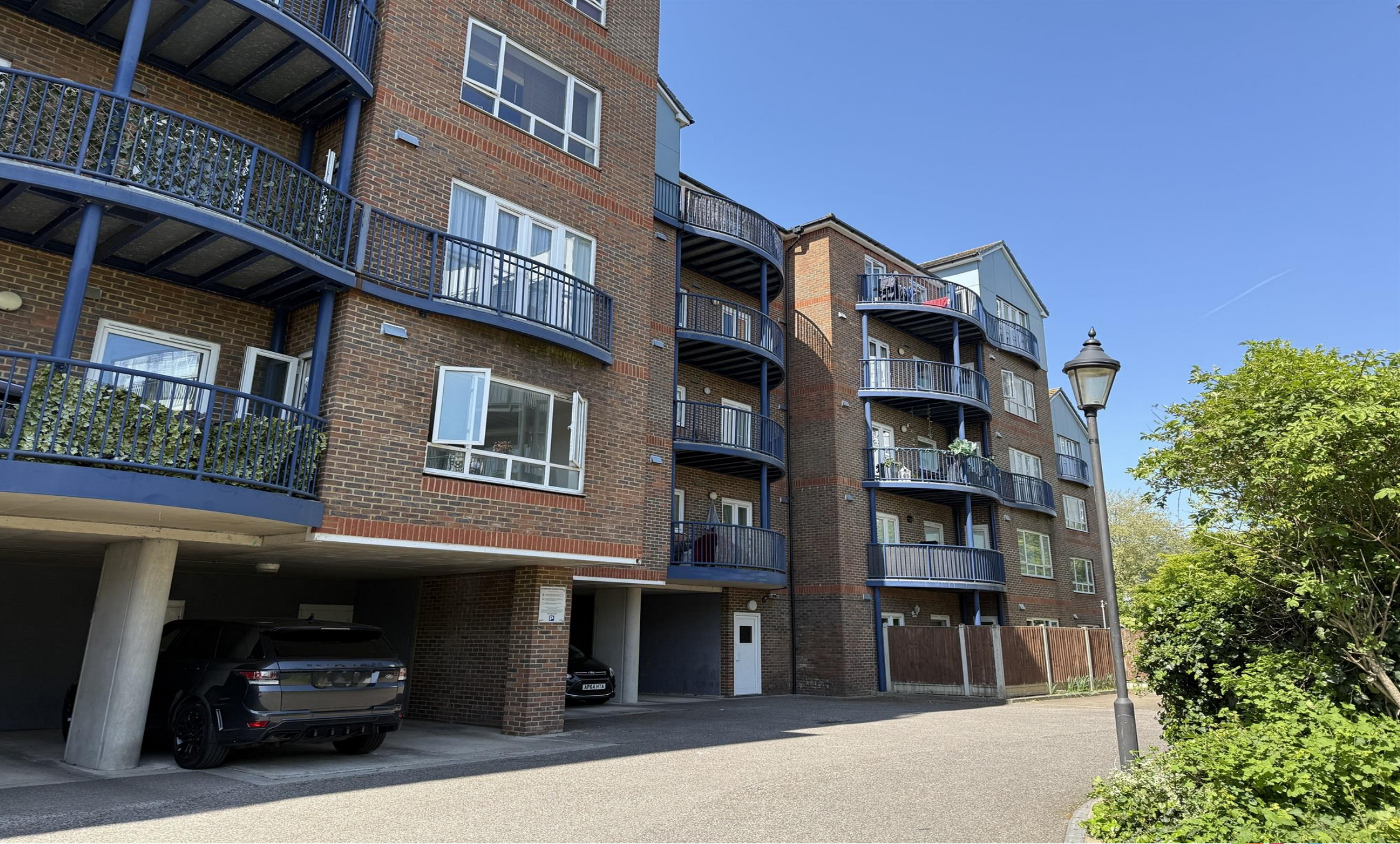
Anchor Court Argent Street, Grays RM17 6QN