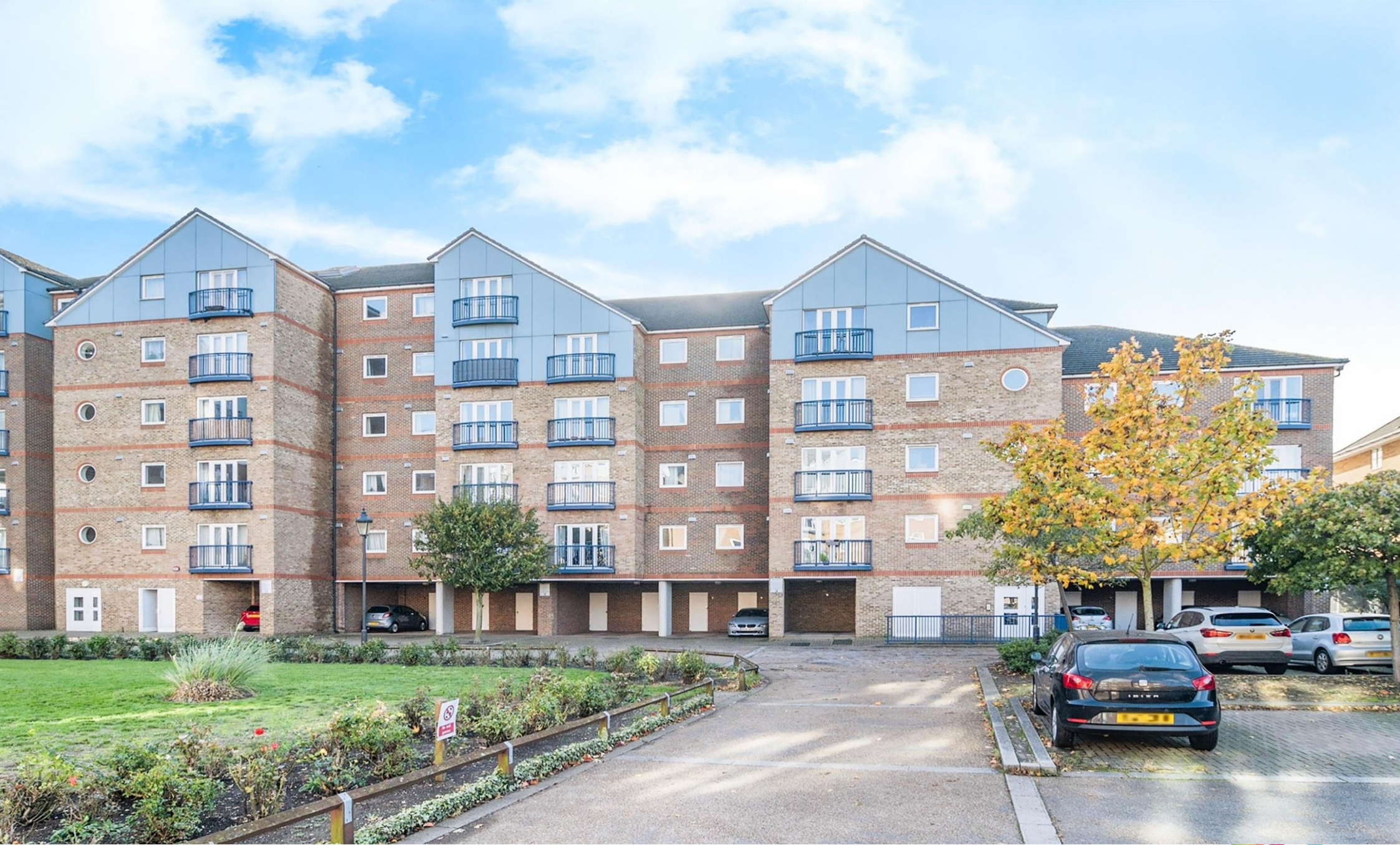
Argent Court, Argent Street, Grays RM17 6TA