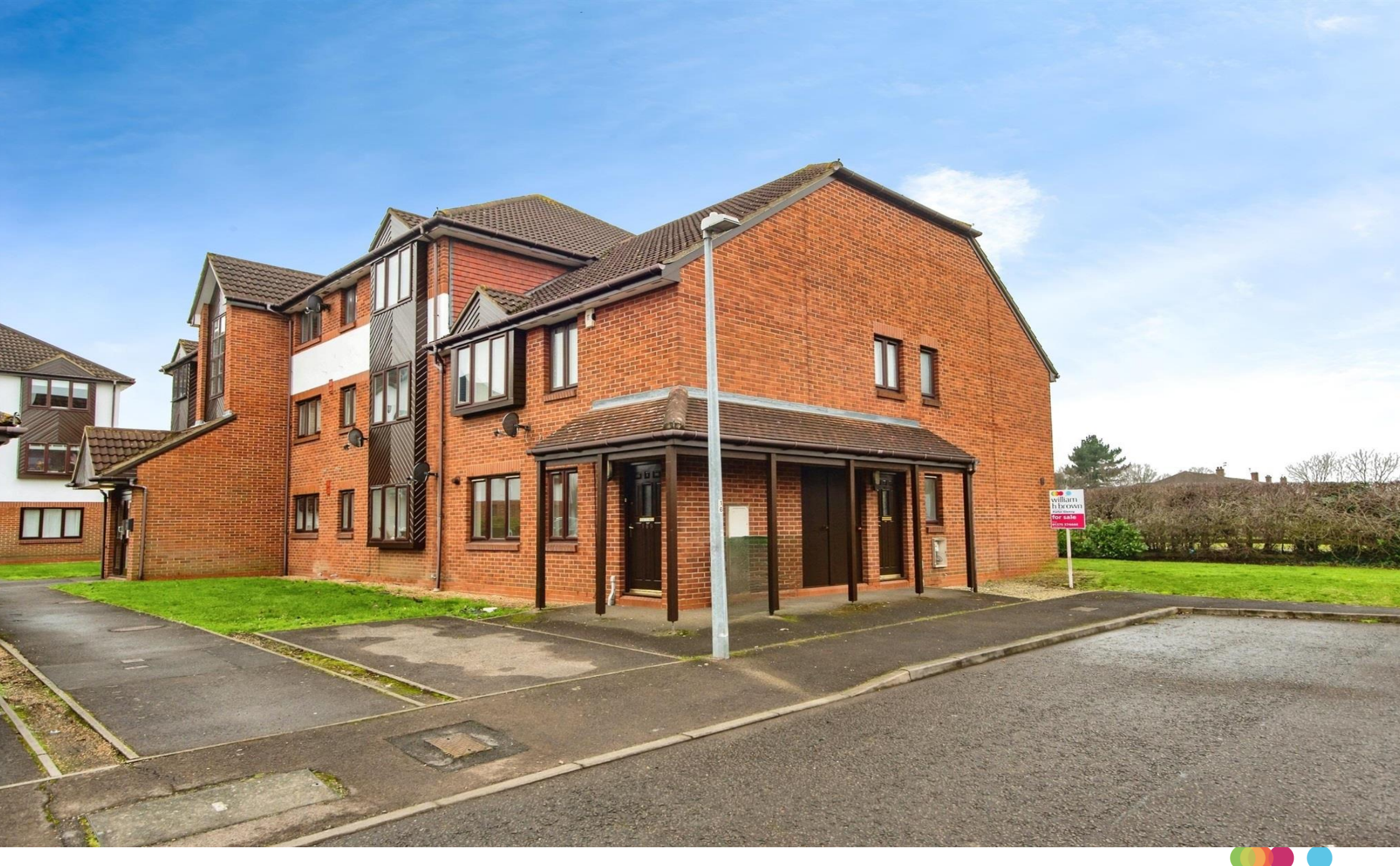
Brimfield Road, Purfleet-On-Thames RM19 1RQ