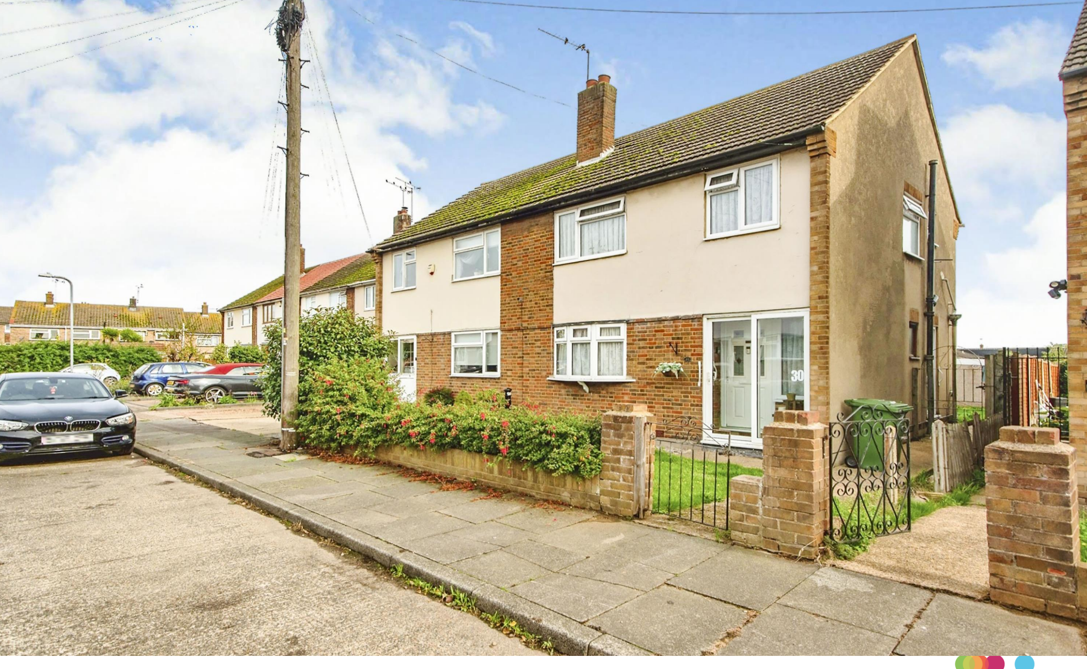
Crescent Way, Aveley, South Ockendon RM15 4TJ