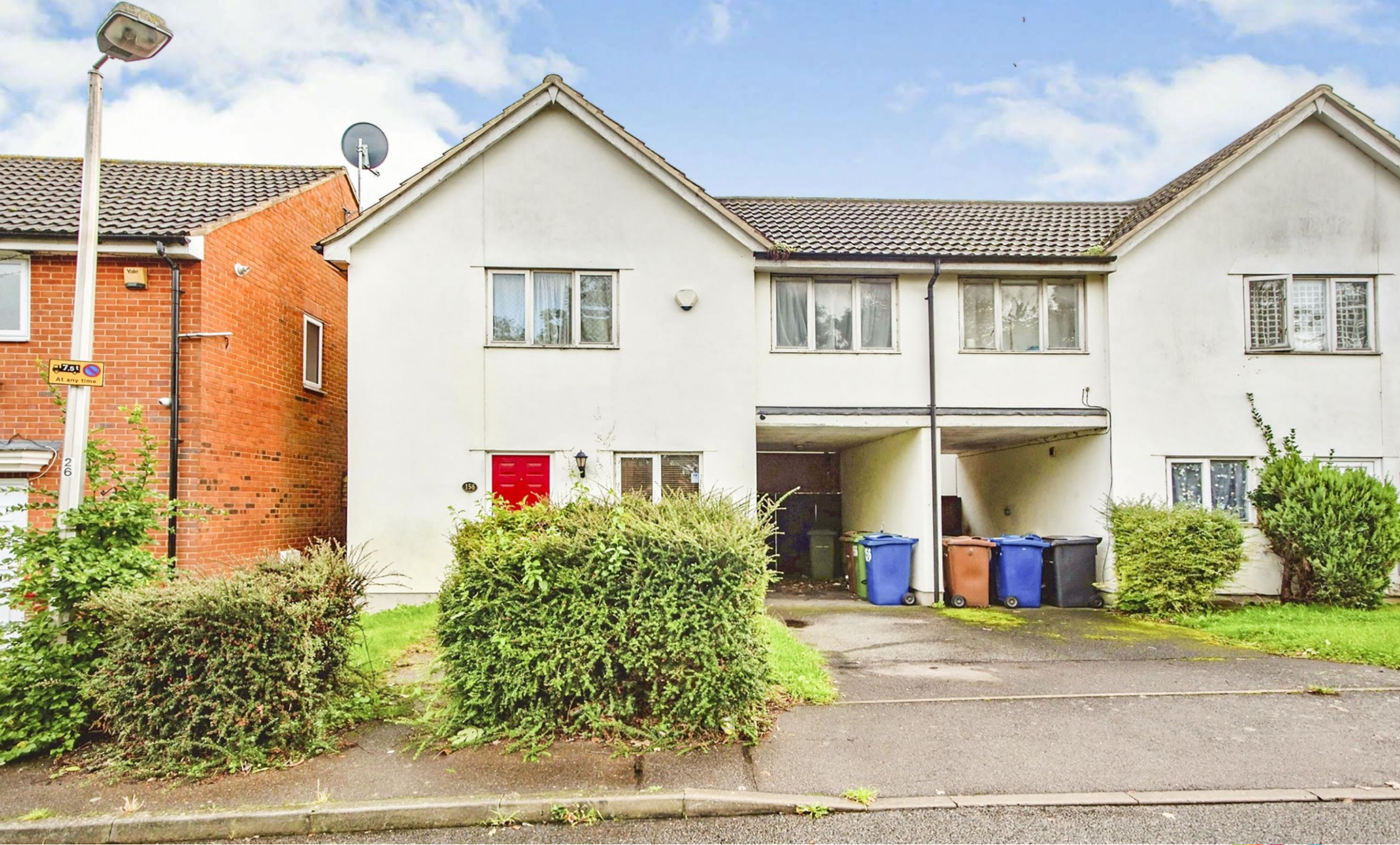
Cherwell Grove, South Ockendon, RM15 6AH