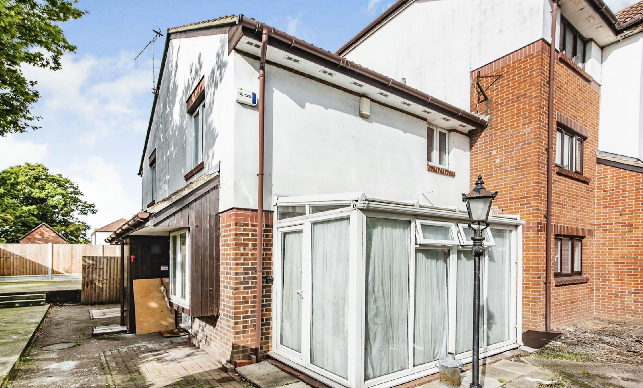
Banner Close, Purfleet-On-Thames RM19 1RN