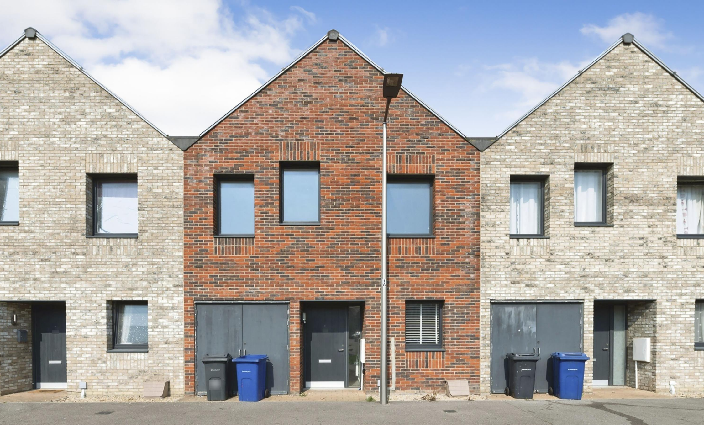
Tilbury Gardens, Tilbury RM18 7AW