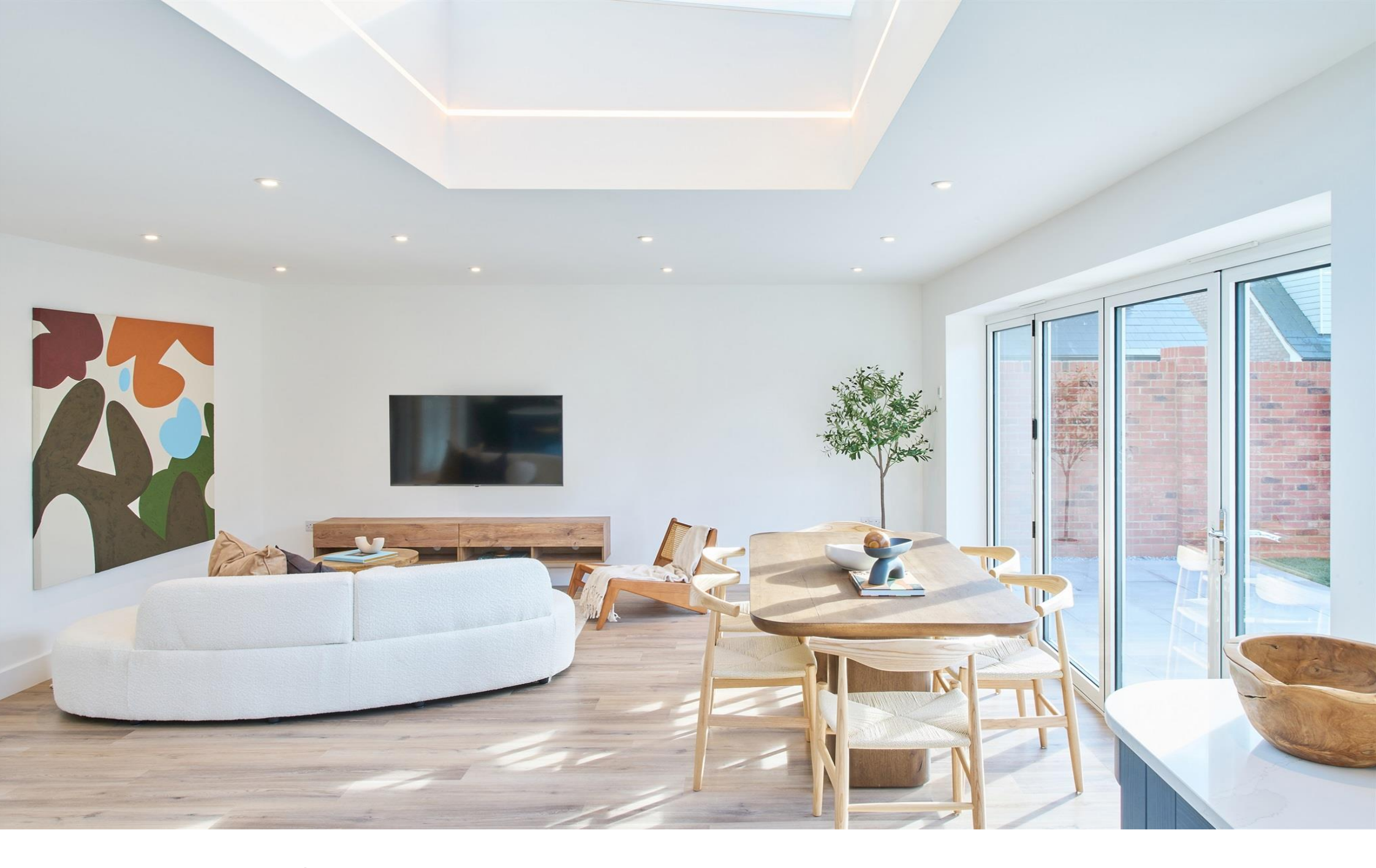
Aldria Road, Stanford-Le-Hope SS17 8DW