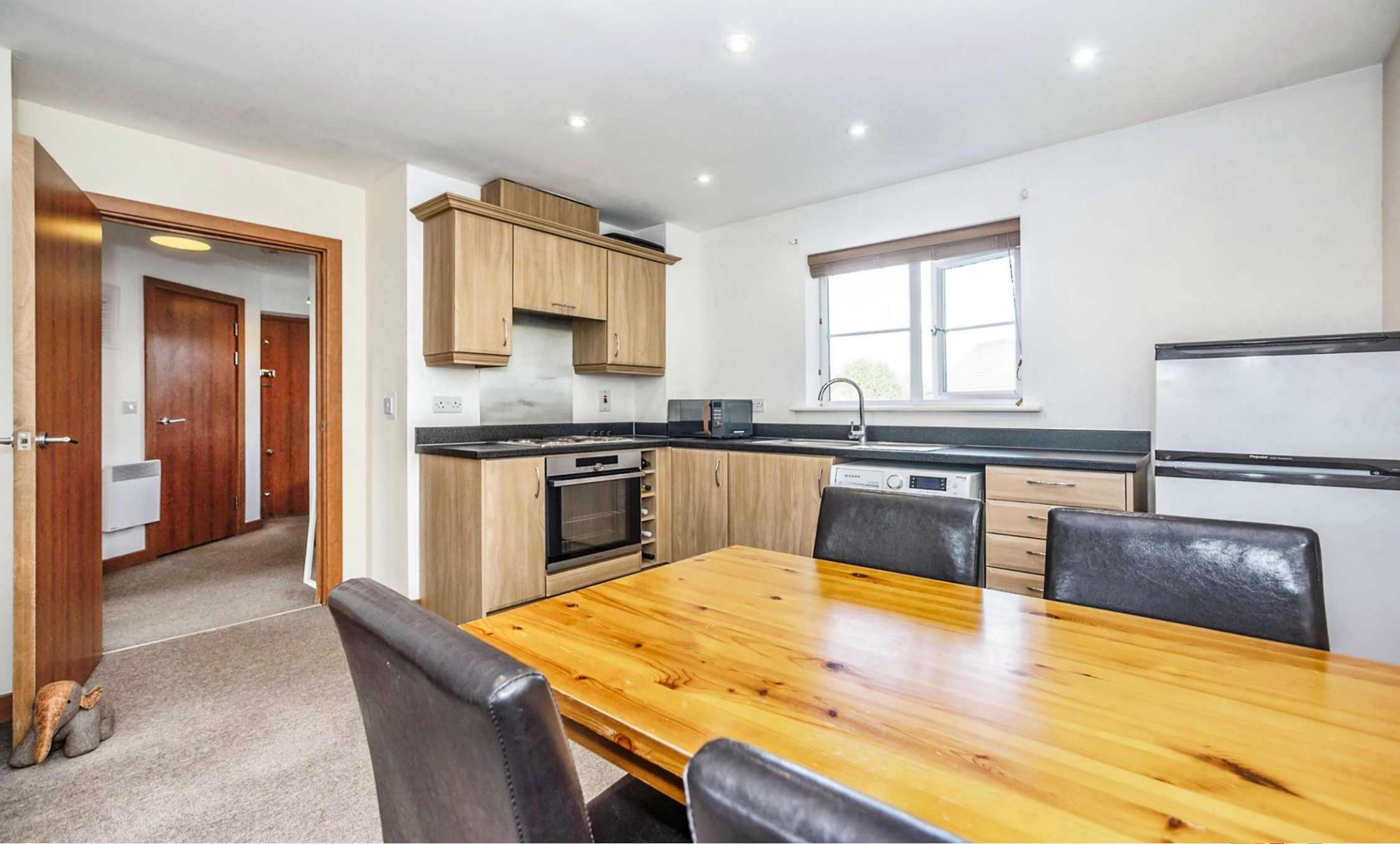
Kendal, Purfleet-On-Thames RM19 1LL