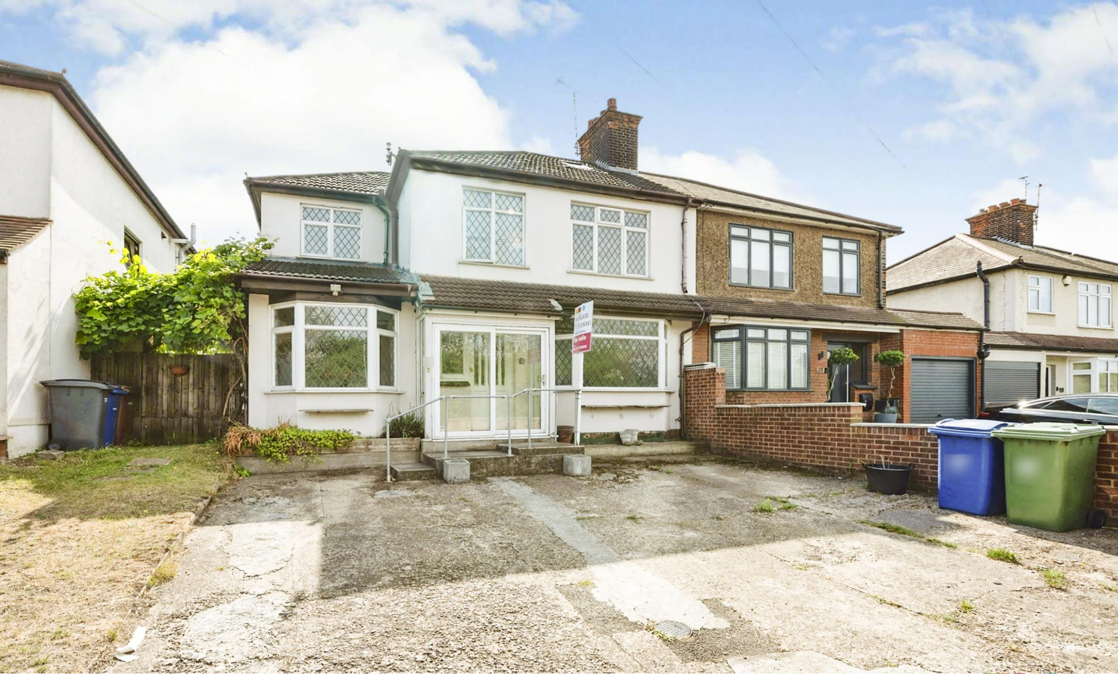
Warren Terrace, Grays RM16 6UT