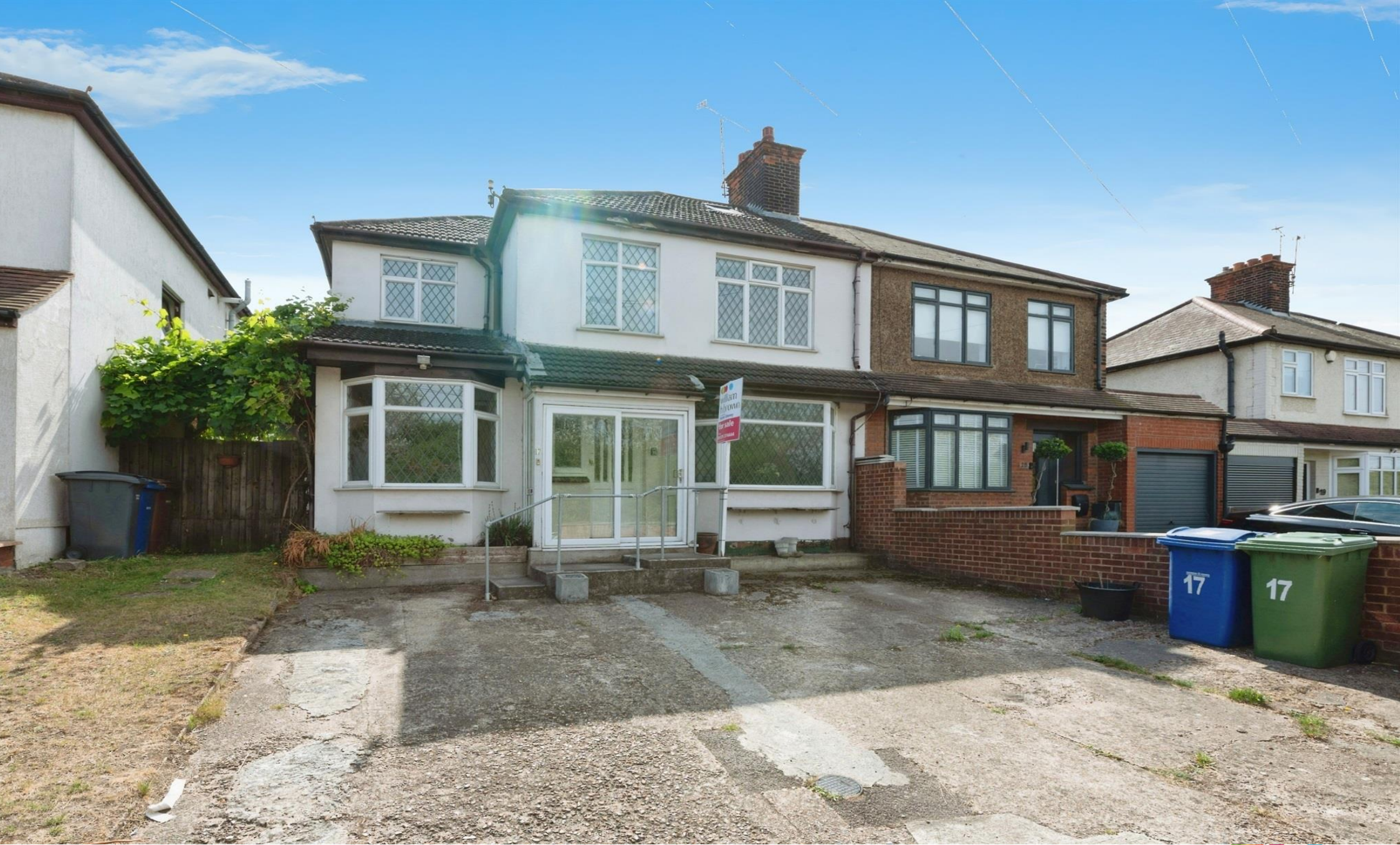
Warren Terrace, Grays RM16 6UT