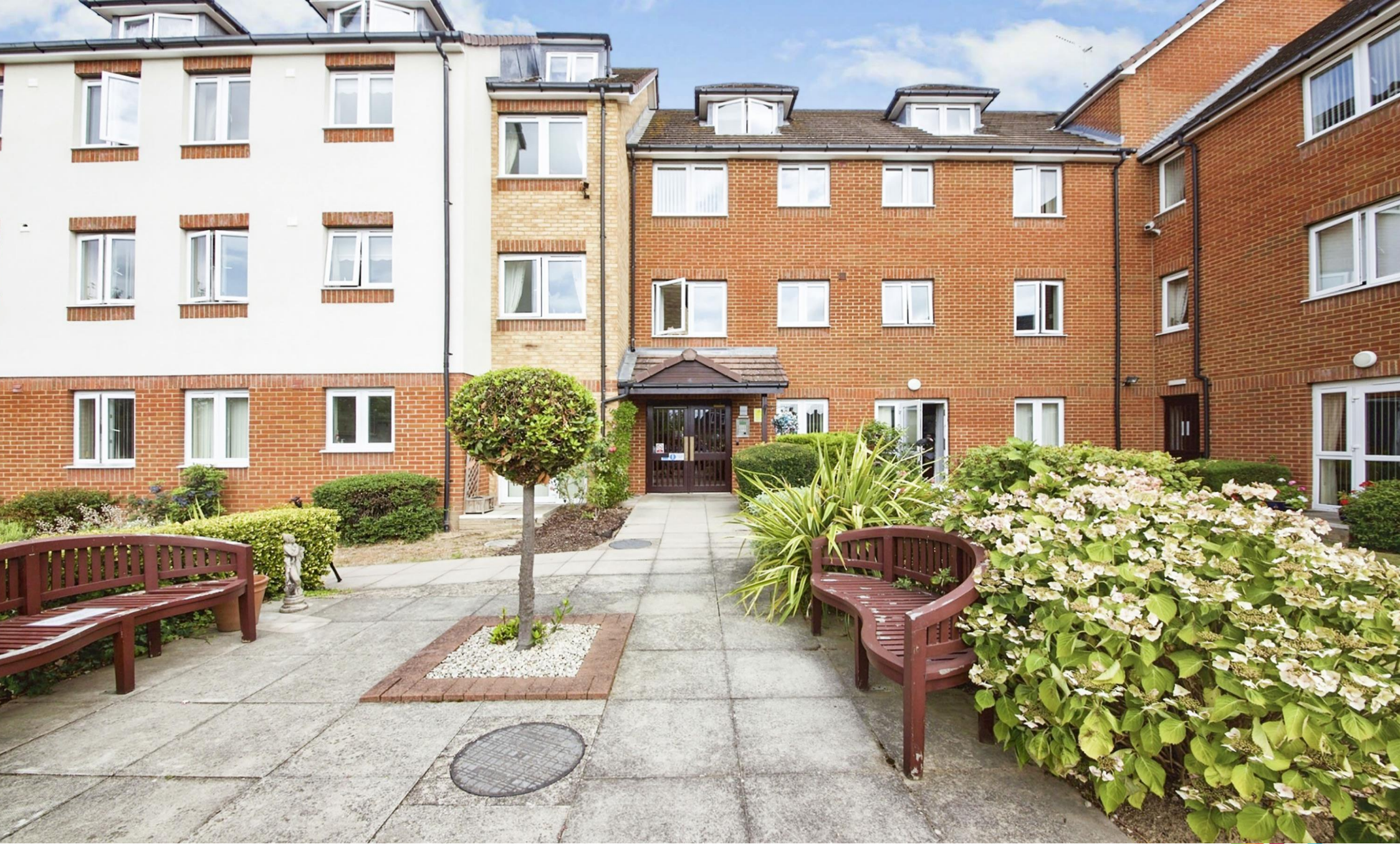
Collier Court, Crammavill Street, Grays RM16 2AZ