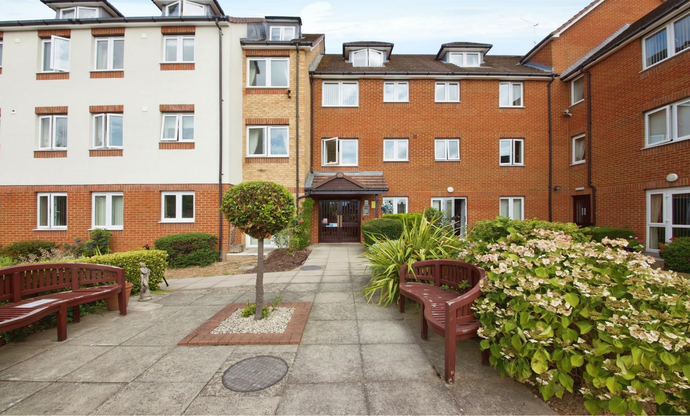
Collier Court Crammavill Street, Grays RM16 2AZ