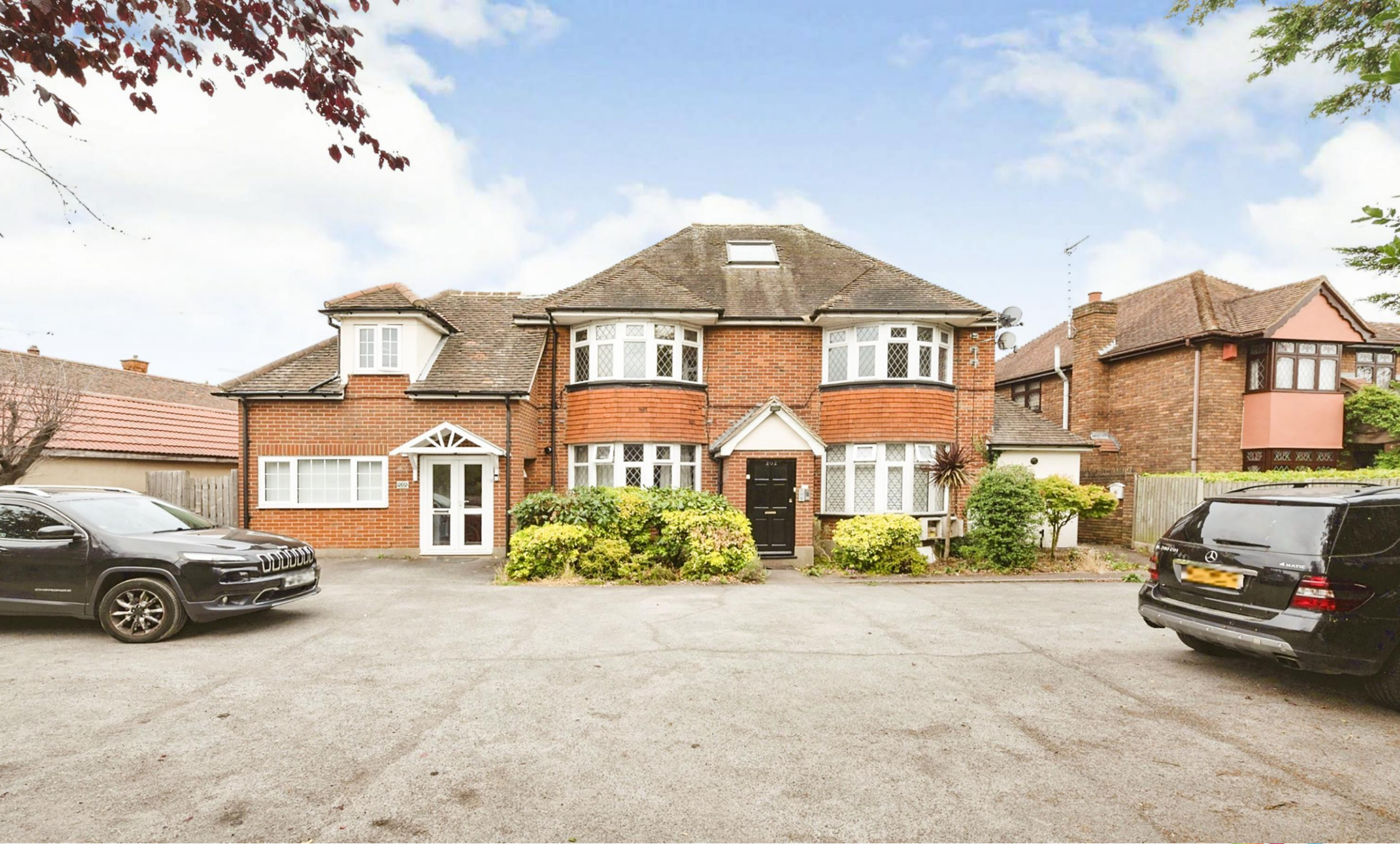
Lodge Lane, North Grays, Grays RM16 2TP