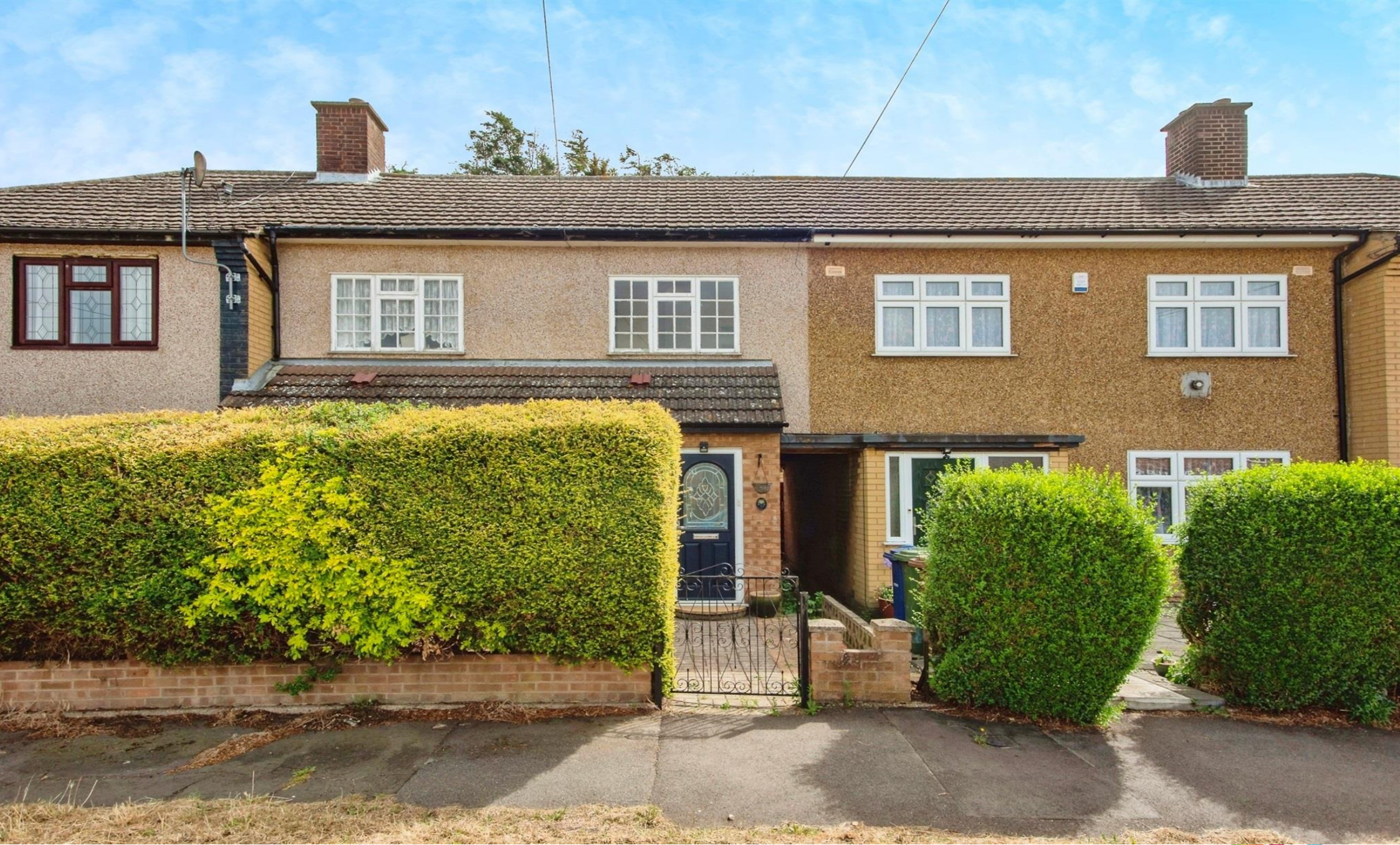
Elan Road, South Ockendon, RM15 5EQ