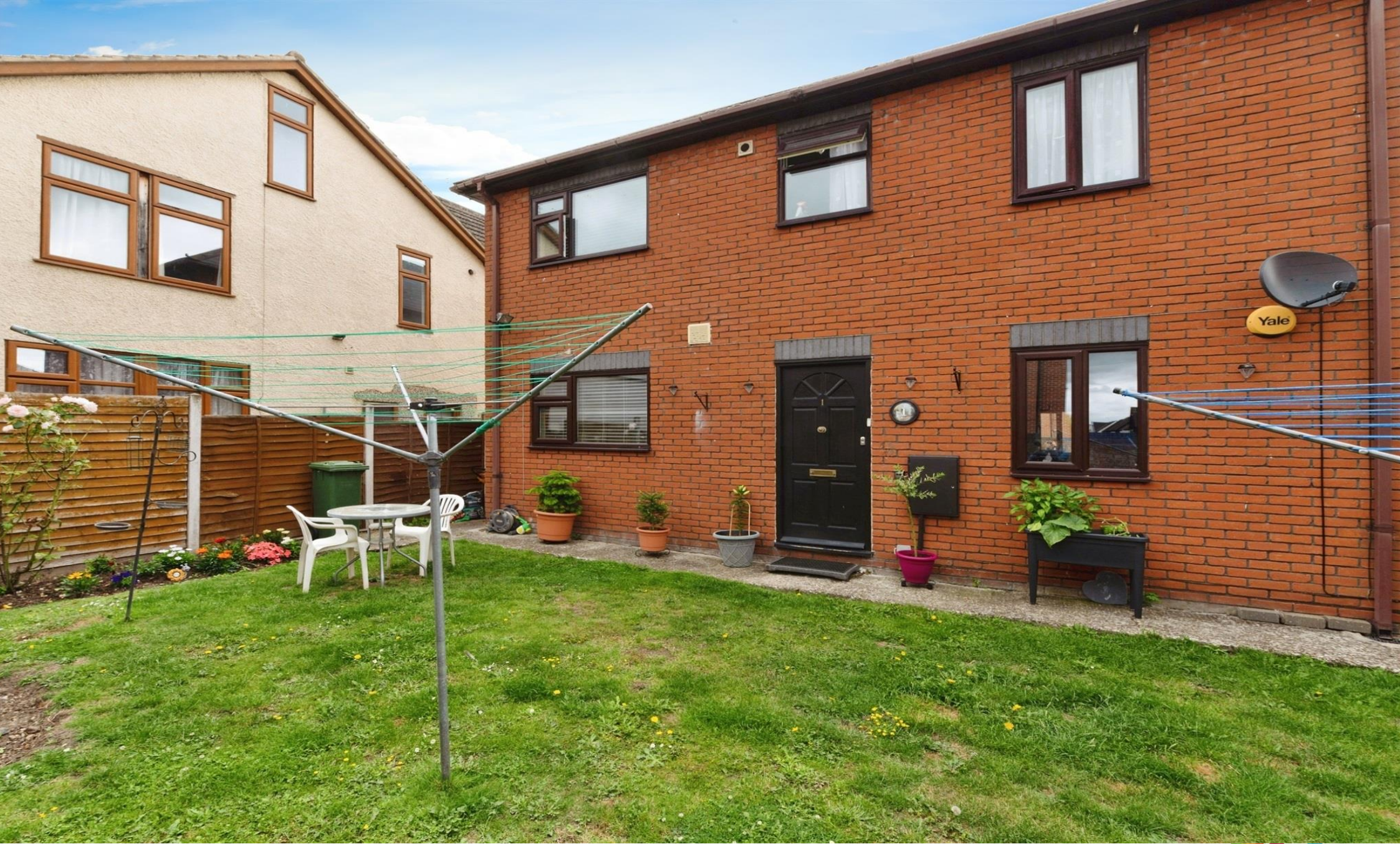
Clifford House, Runnymede Road, Stanford-Le-Hope SS17 0JY