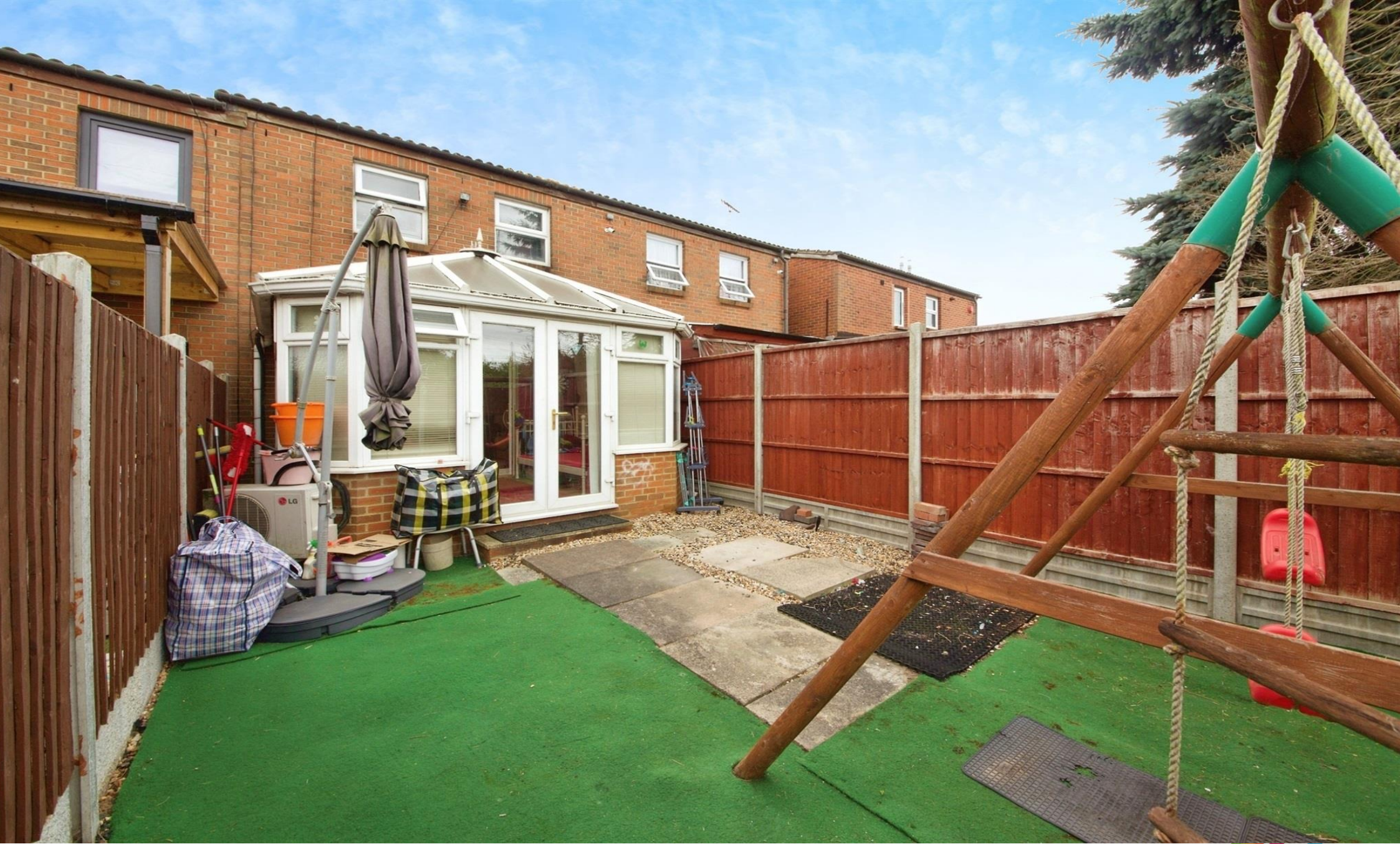
Water Lane, Purfleet-On-Thames RM19 1GU