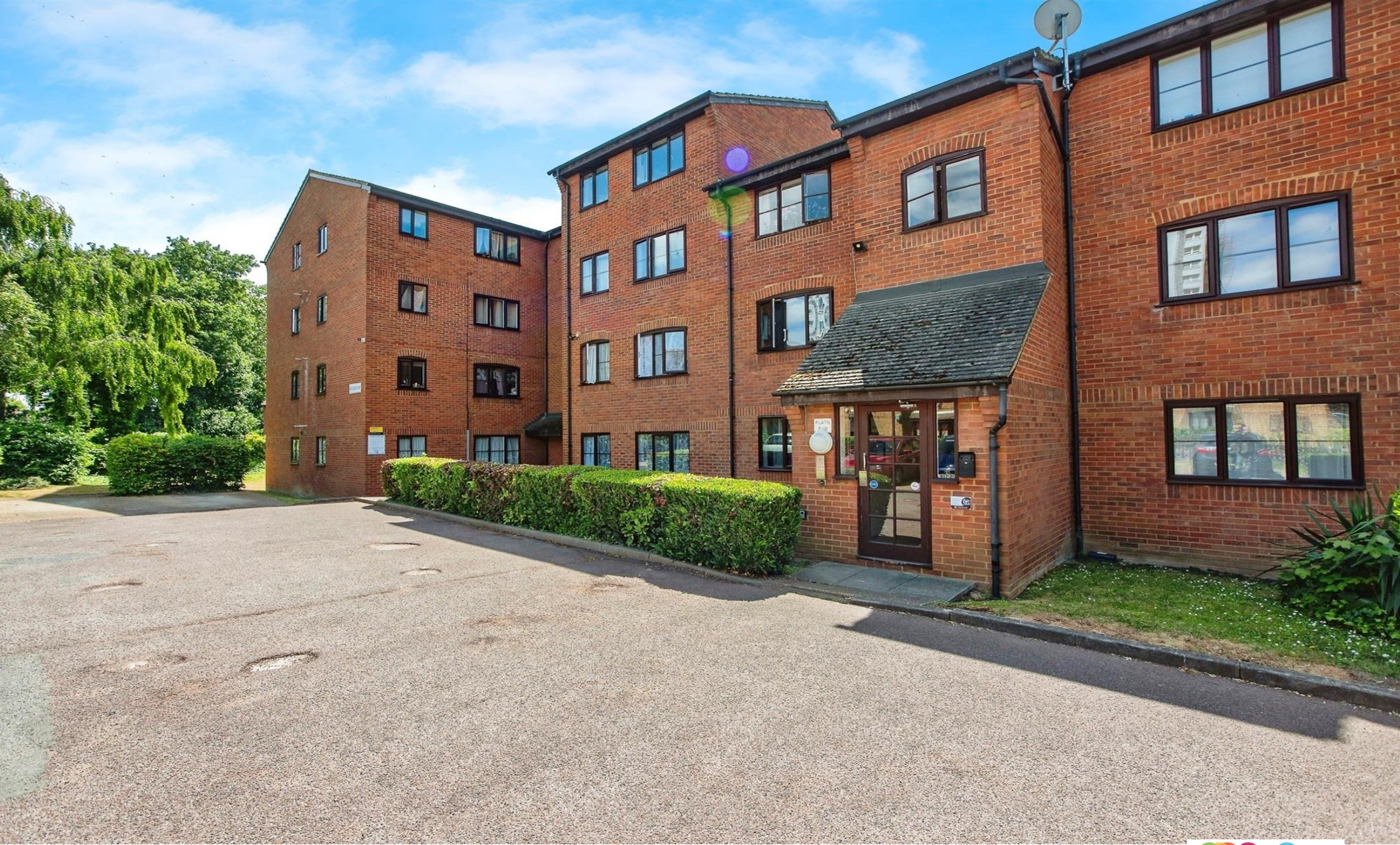
Beville House, Argent Street, Grays RM17 6RR