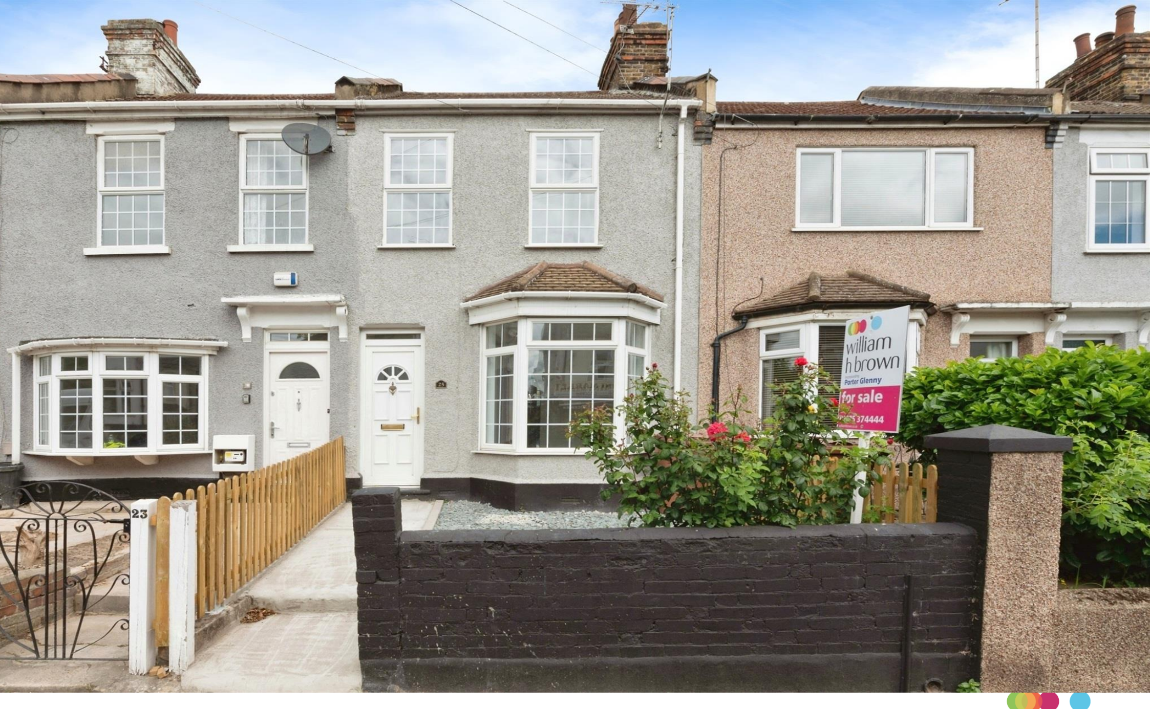
Chadwell Road, Grays RM17 5SY