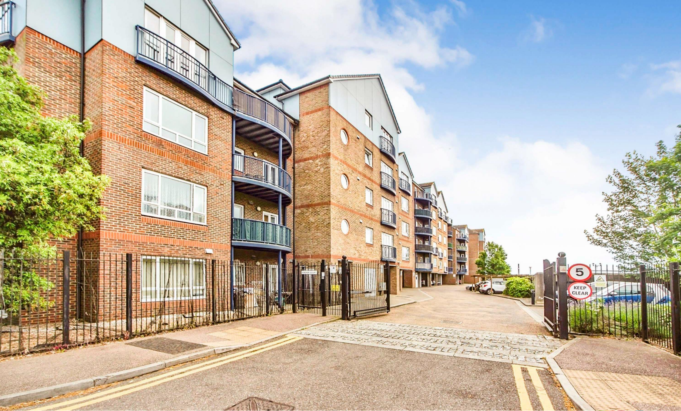
Anchor Court, Argent Street, Grays RM17 6QN