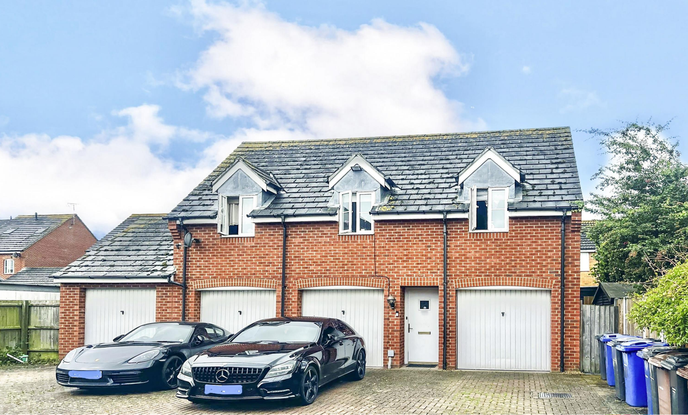
Wingfield Drive, Orsett, Grays RM16 3HW