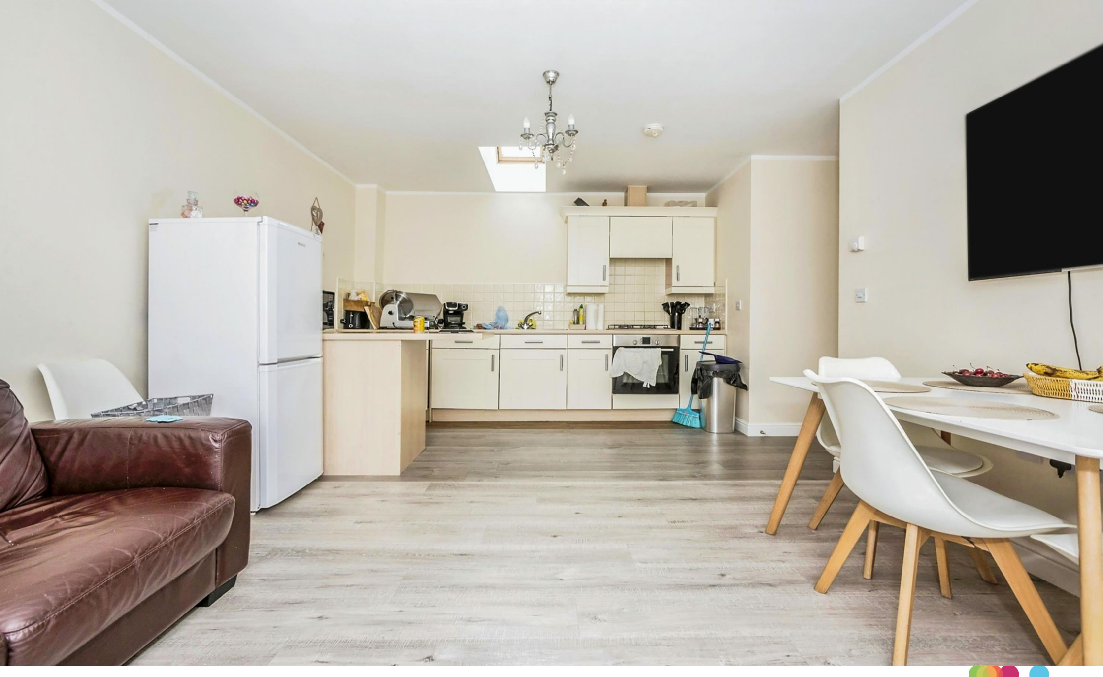
Wingfield Drive, Orsett Grays RM16 3HW