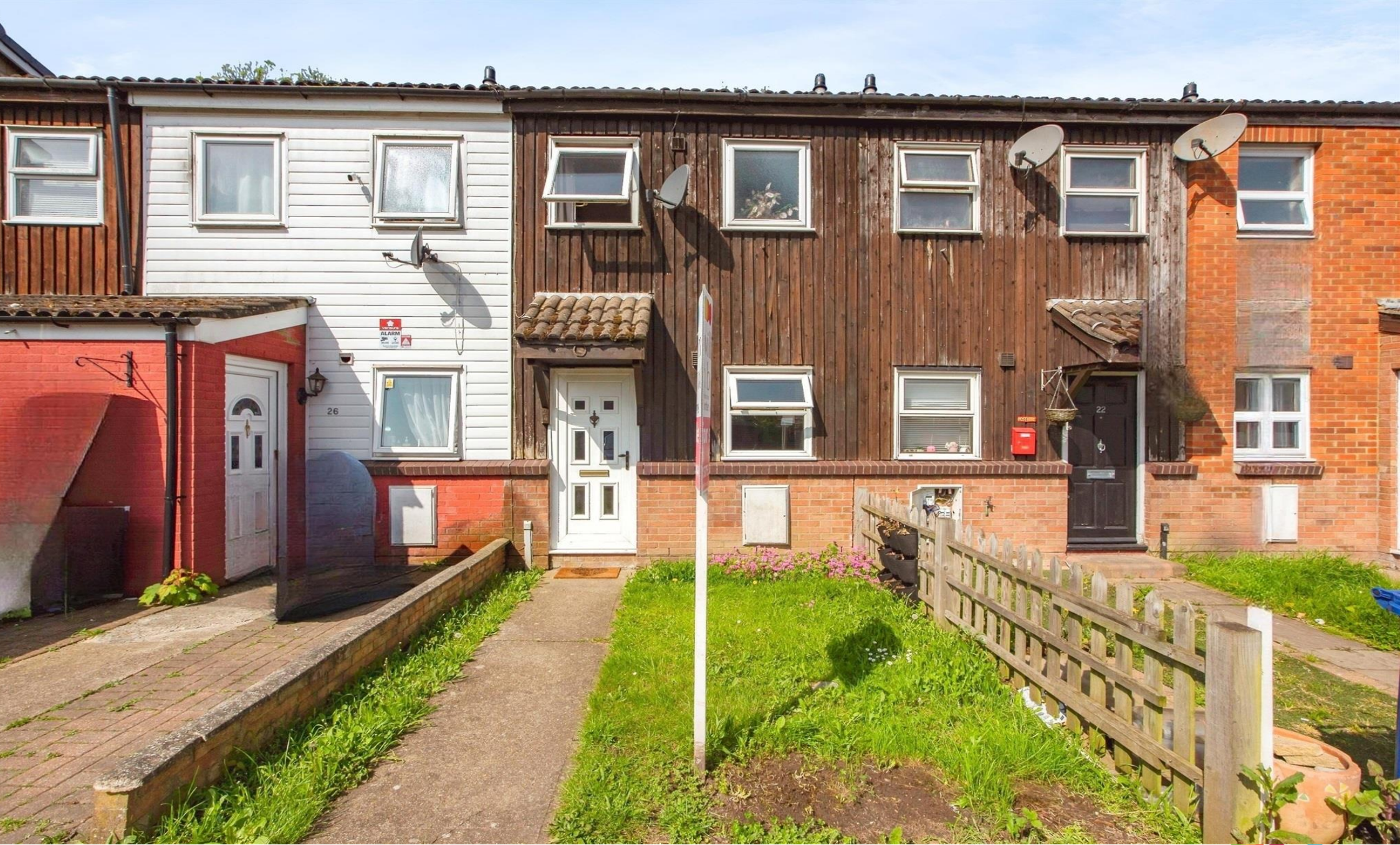
Long Court, Purfleet-On-Thames RM19 1GA