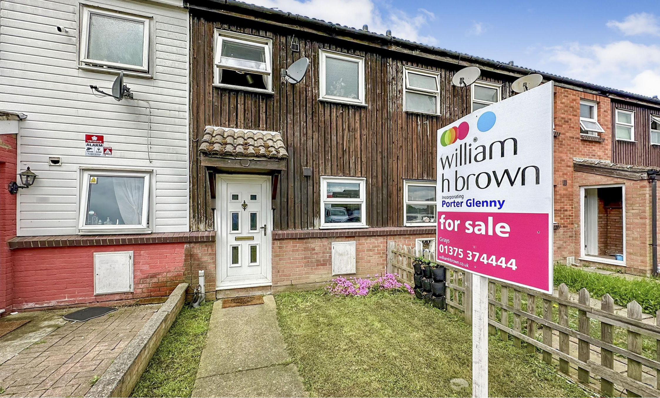
Long Court, Purfleet-On-Thames RM19 1GA