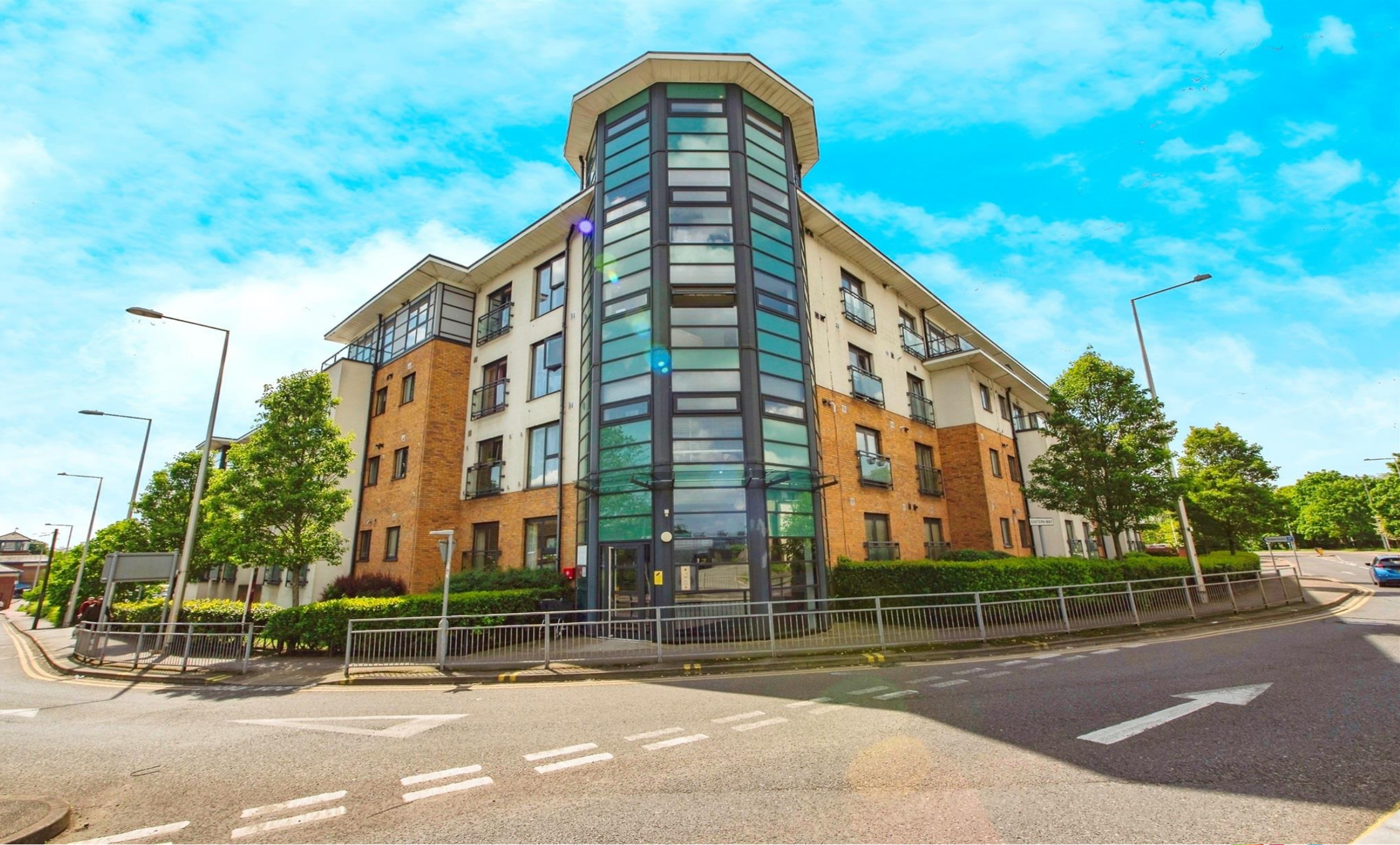
Albany Heights, Hogg Lane, Grays RM17 5XN