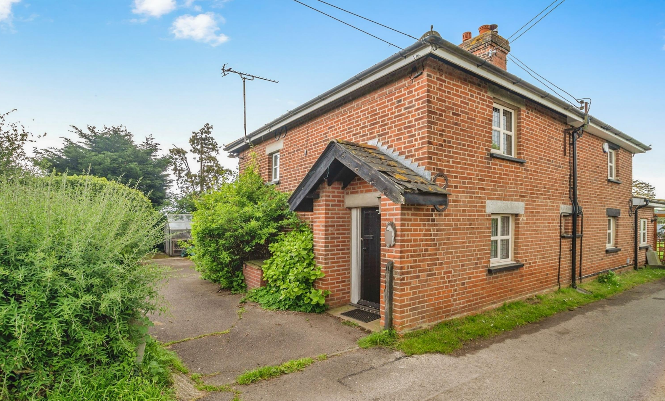
Parkers Farm Cottages, Parkers Farm Road, Orsett Grays RM16 3HX