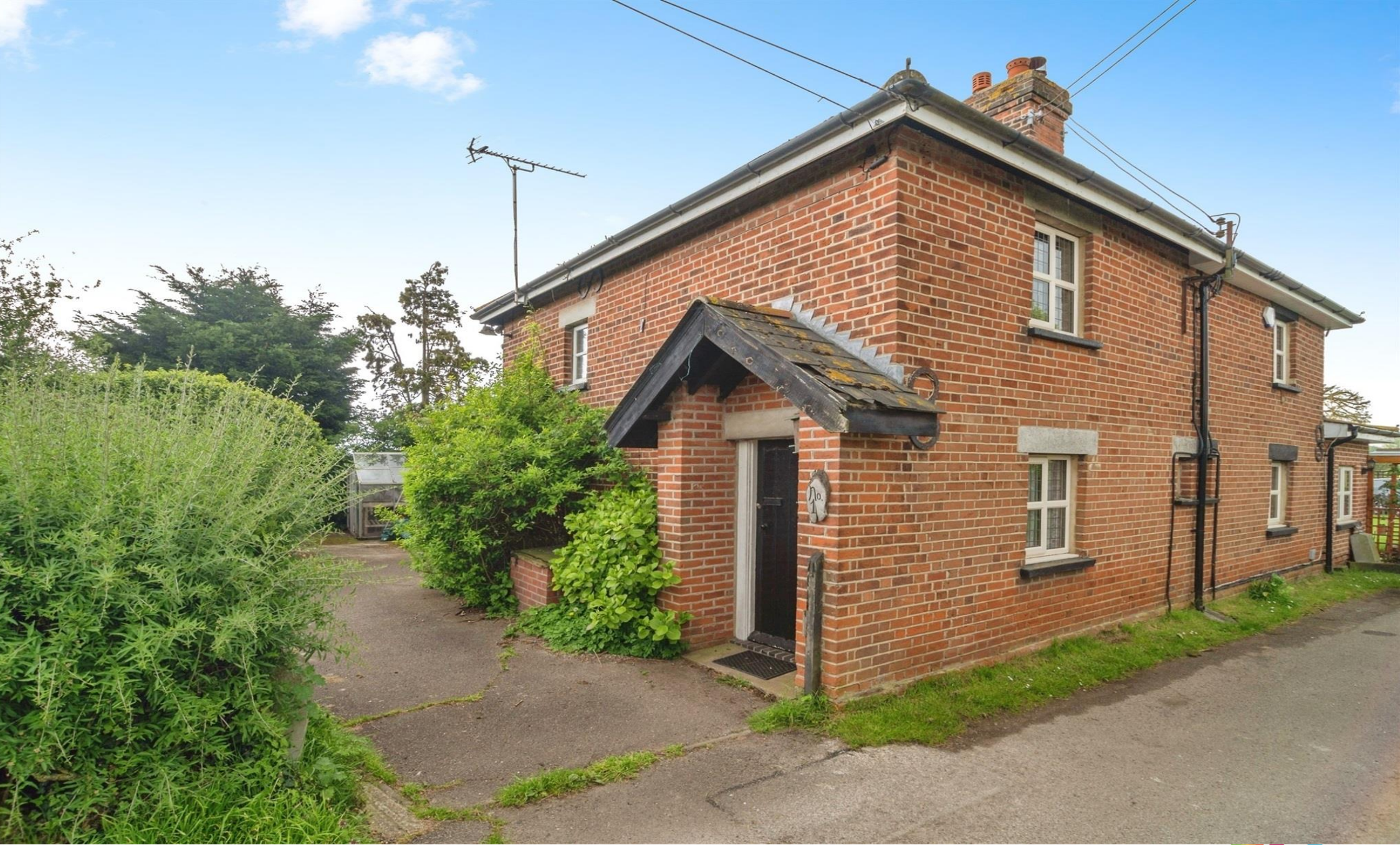
Parkers Farm Cottages, Parkers Farm Road, Orsett Grays RM16 3HX