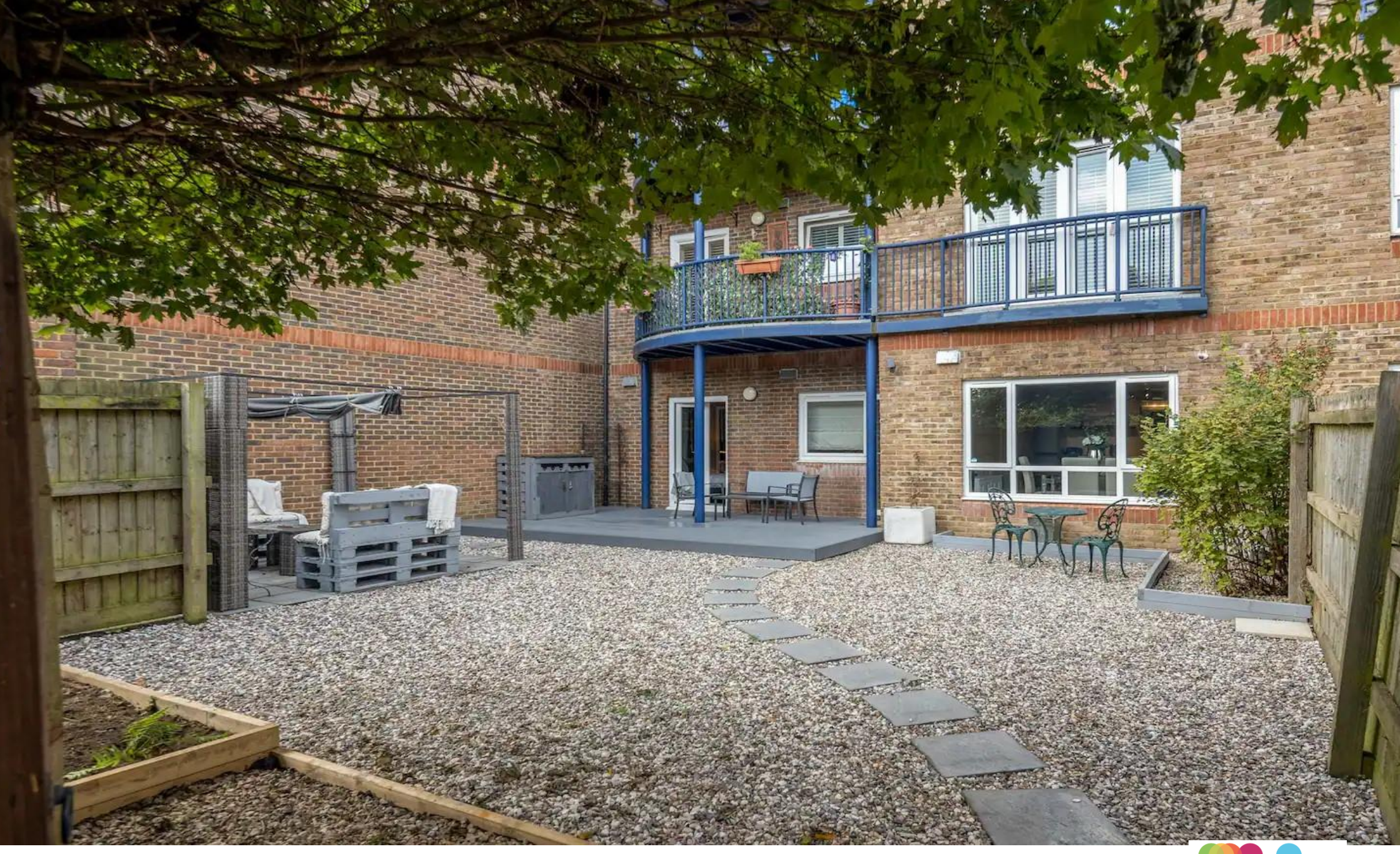
Anchor Court, Argent Street, Grays RM17 6QP