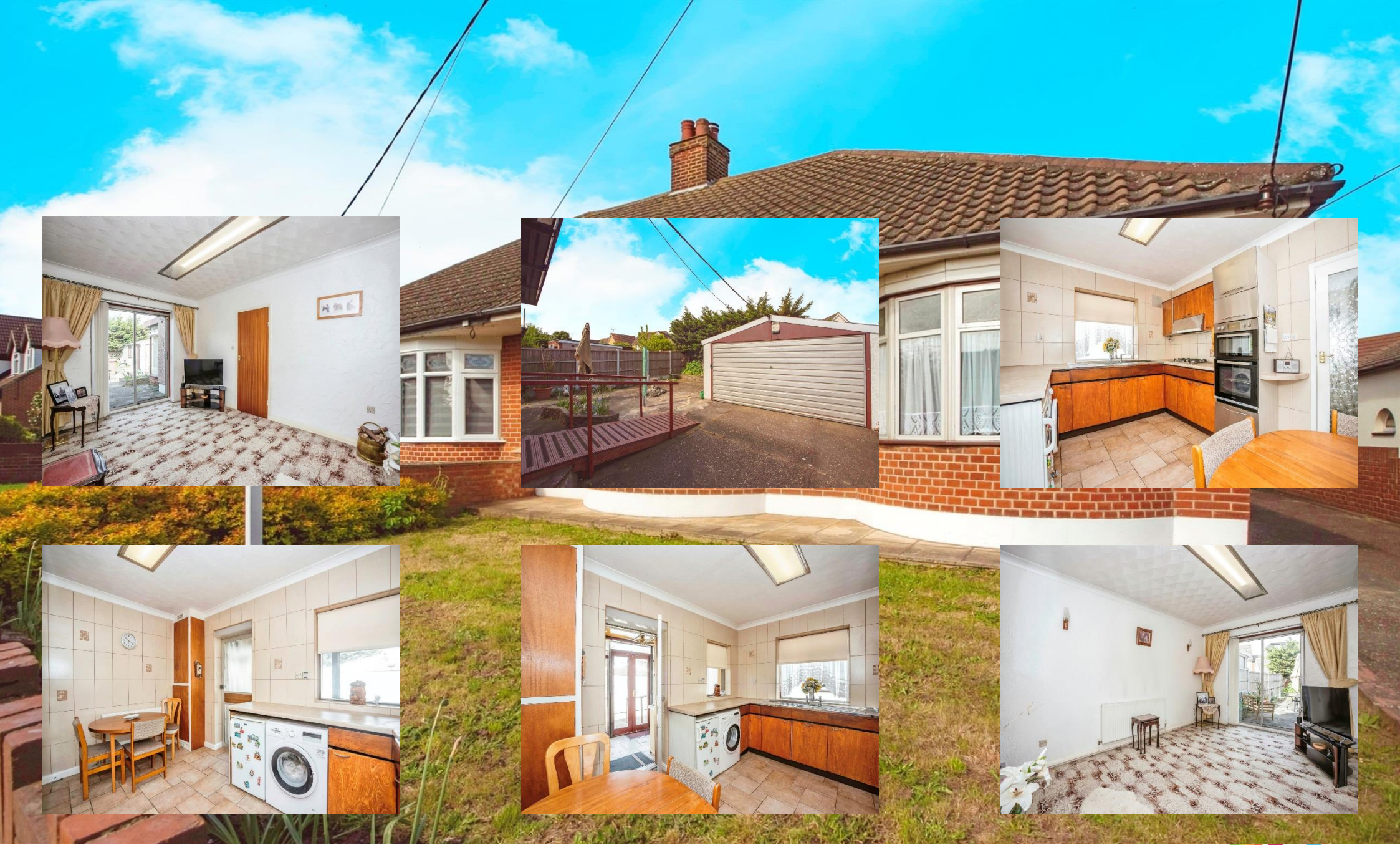
Ballina Sandy Lane, Chadwell St Mary, Grays RM16 4LR