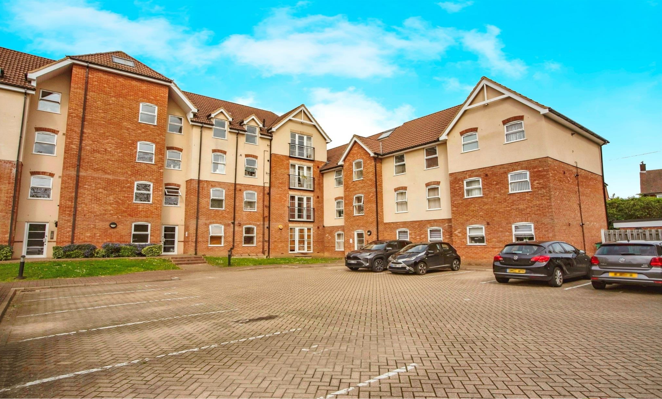
Sartoria Court, Lenthall Avenue, Grays RM17 5AA