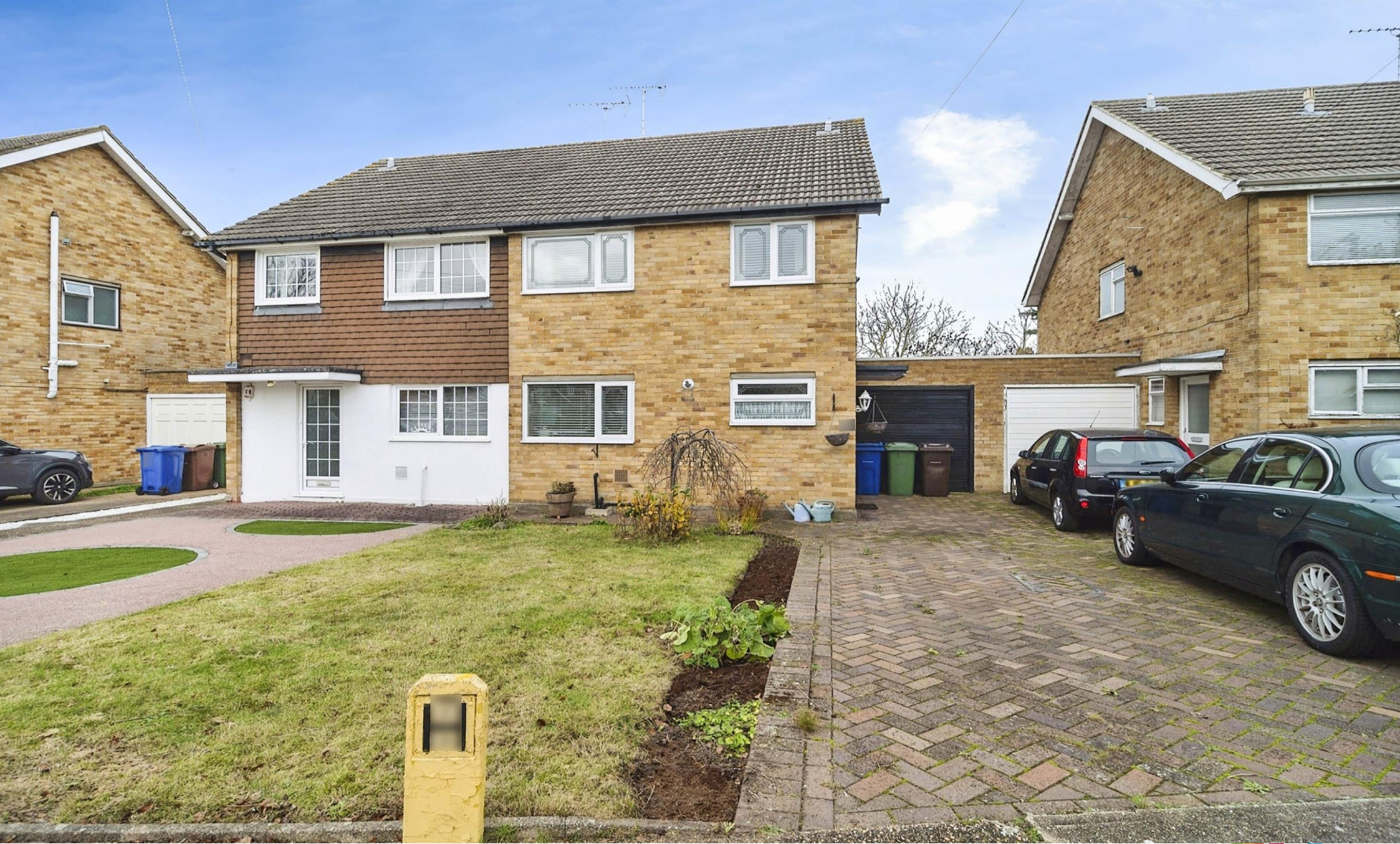
Parkway, Orsett Grays RM16 3HA