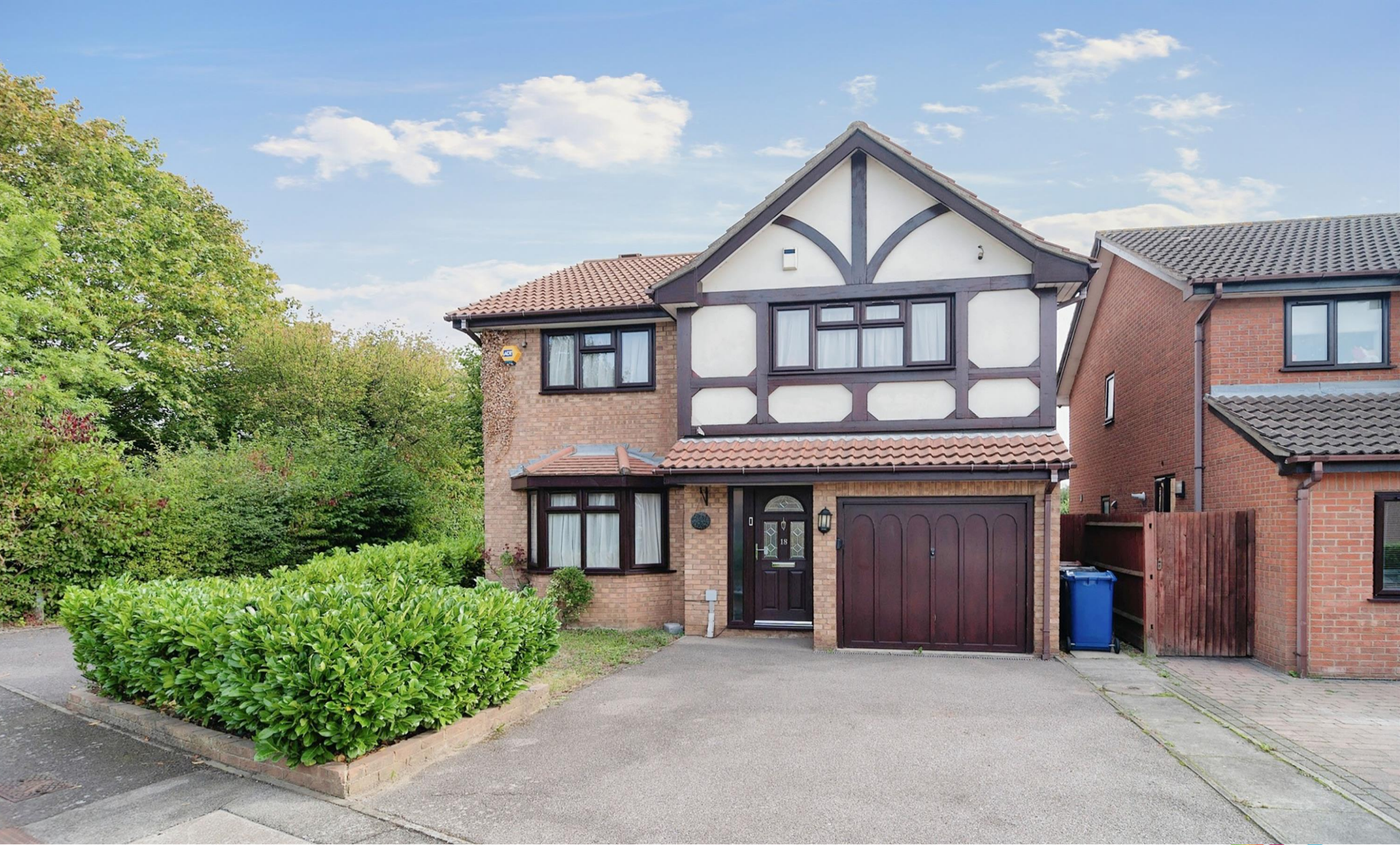
Catharine Close, Chafford Hundred Grays RM16 6QH