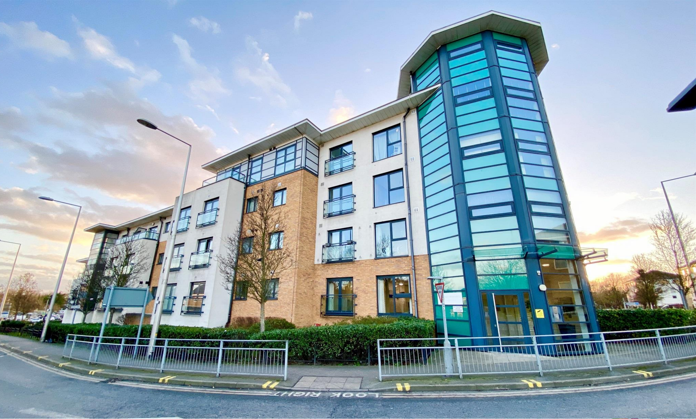
Albany Heights, Hogg Lane, Grays RM17 5XN