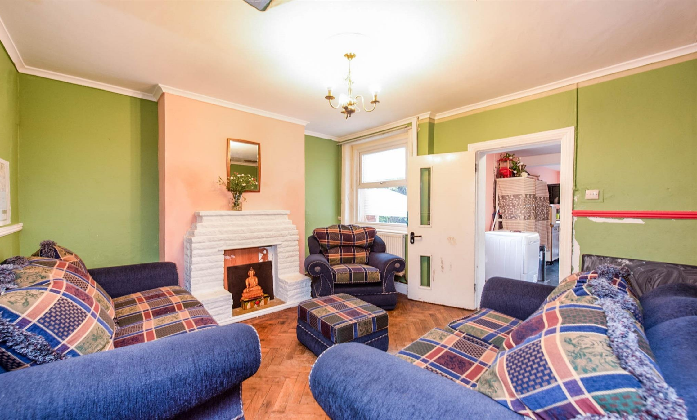
Southland Terrace London Road, Purfleet RM19 1RA