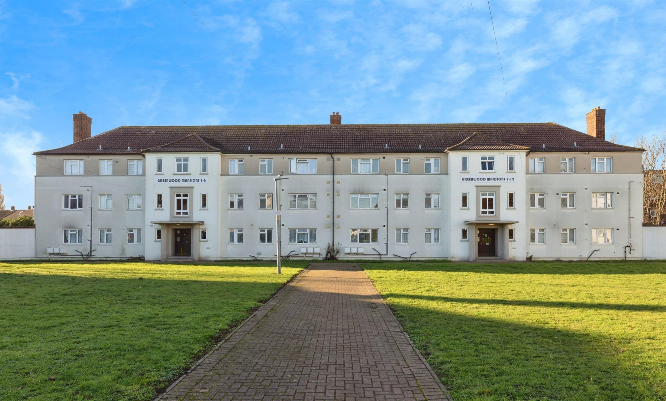
Greenwood Mansions, Lansbury Avenue, Barking, IG11 9NJ