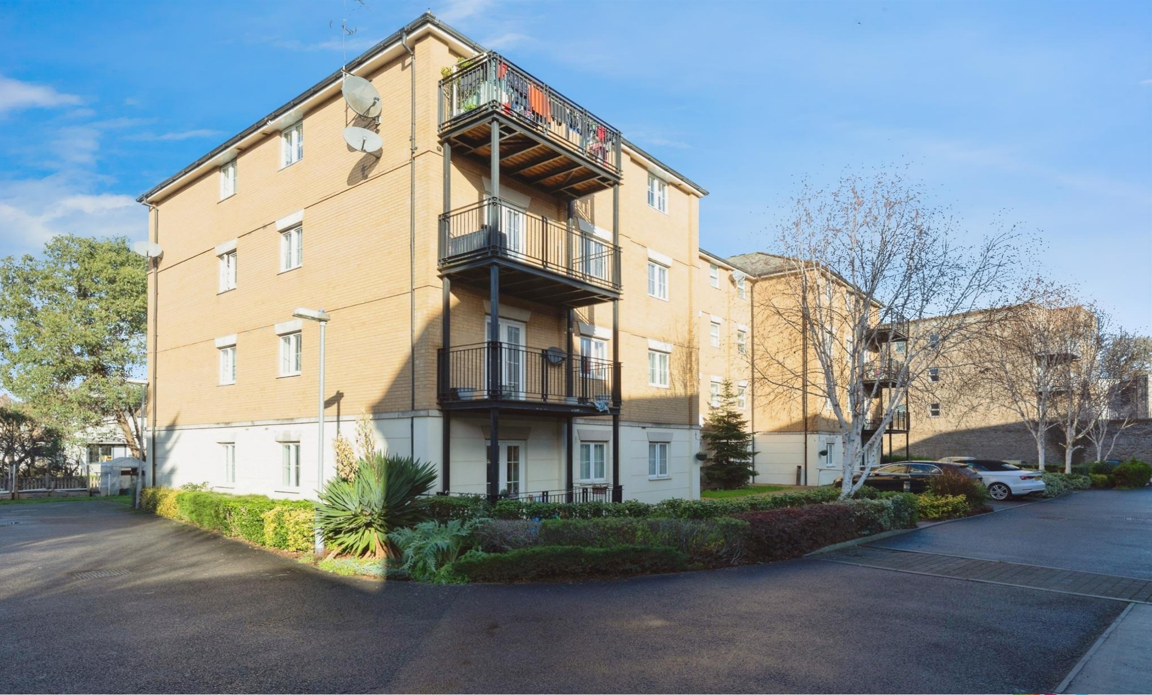
Sixpenny Court, Tanner Street, Barking, IG11 8PQ