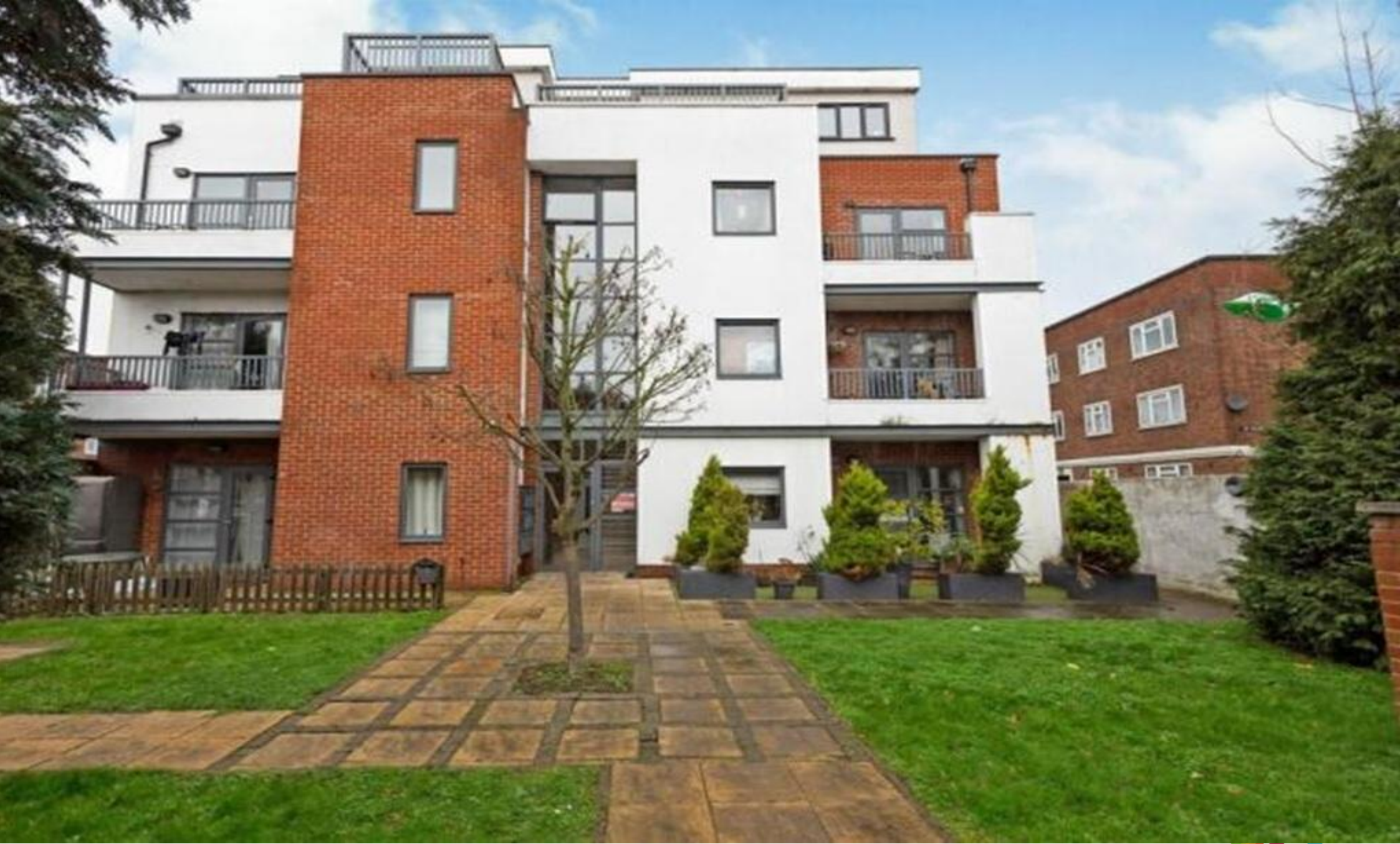
Bay Tree Court, Longbridge Road, Barking, IG11 9DH