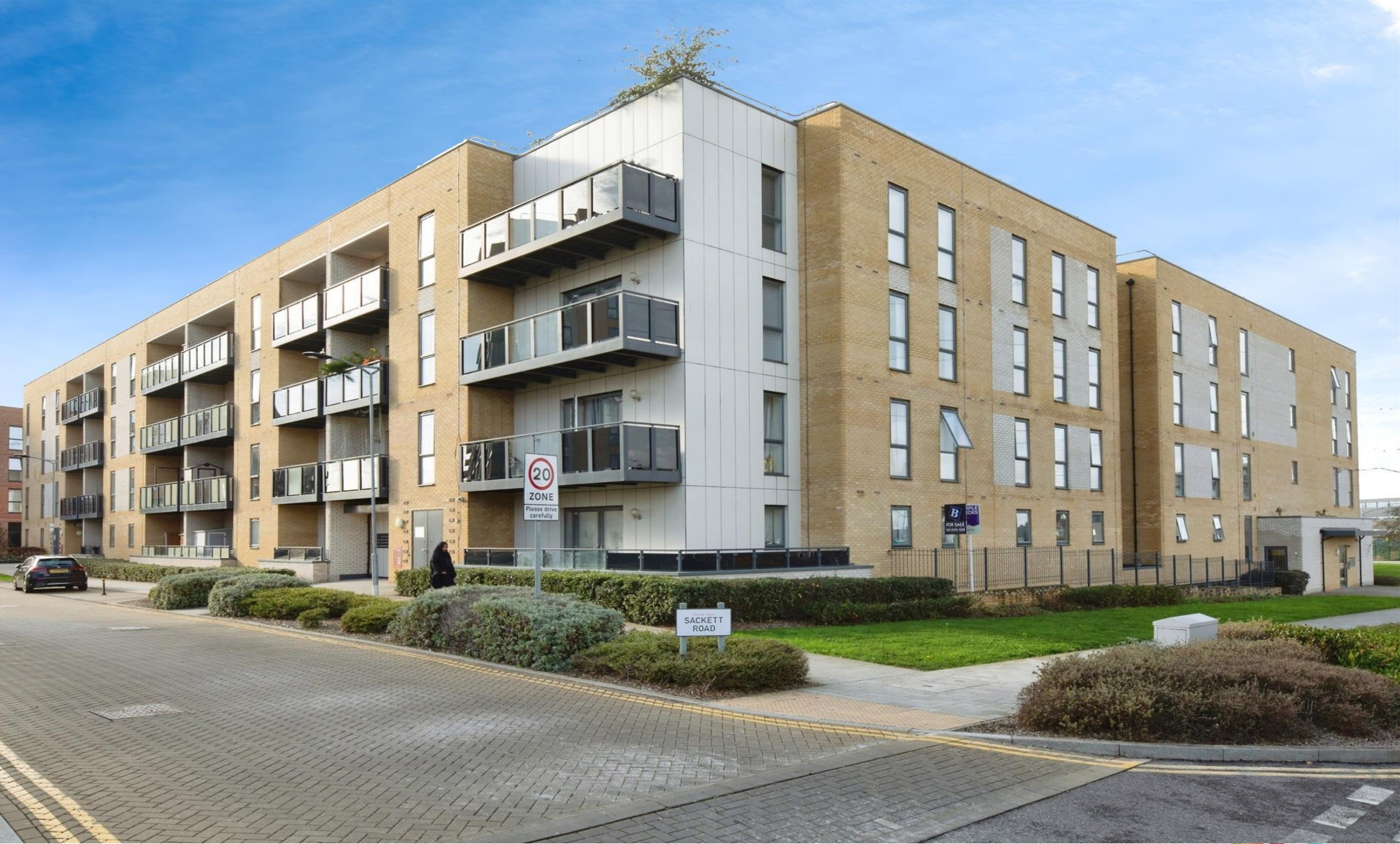
Dalton House, Handley Page Road, Barking, IG11 0UZ