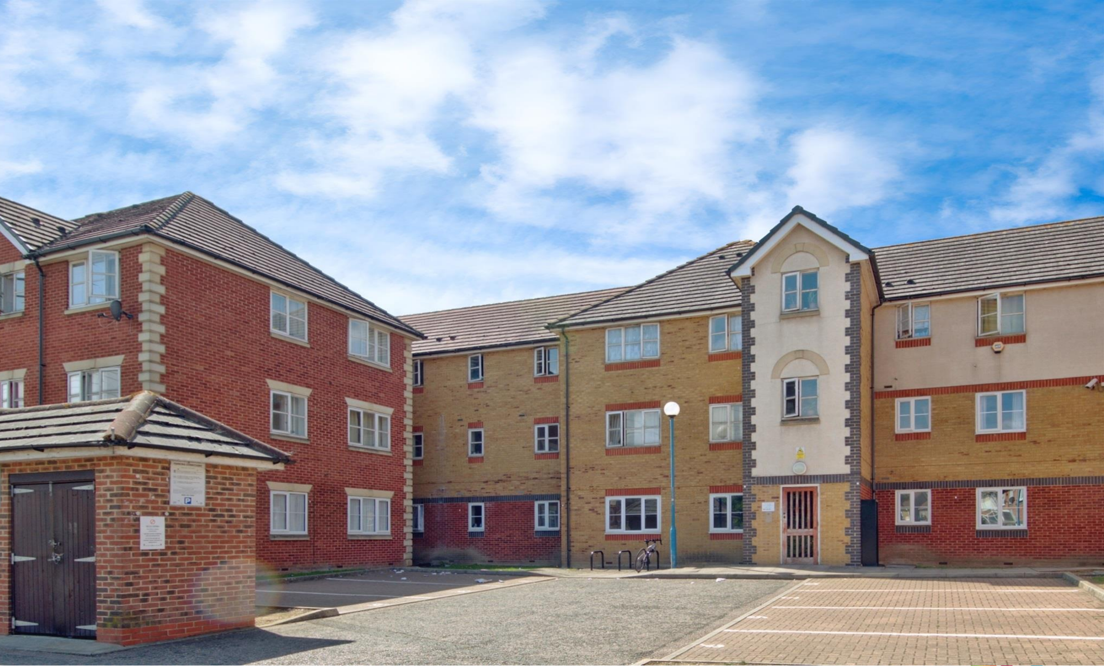
Bellingham Court, Wanderer Drive, Barking, IG11 0XN