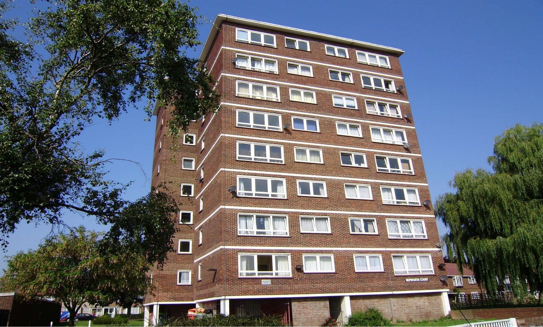
Hepworth Court, Hepworth Gardens, Barking, IG11 9AZ