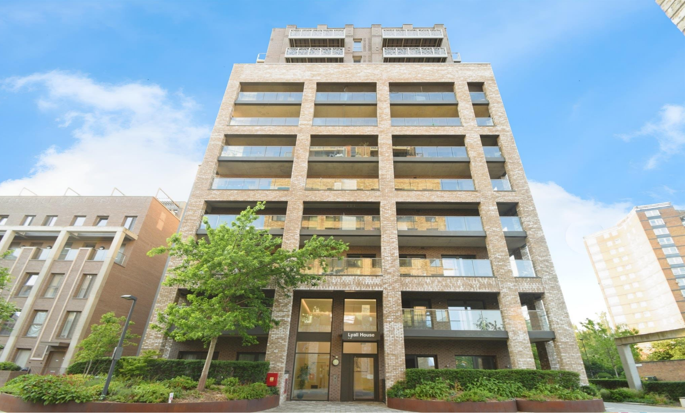
Lyall House, Shipbuilding Way, London, E13 9DW