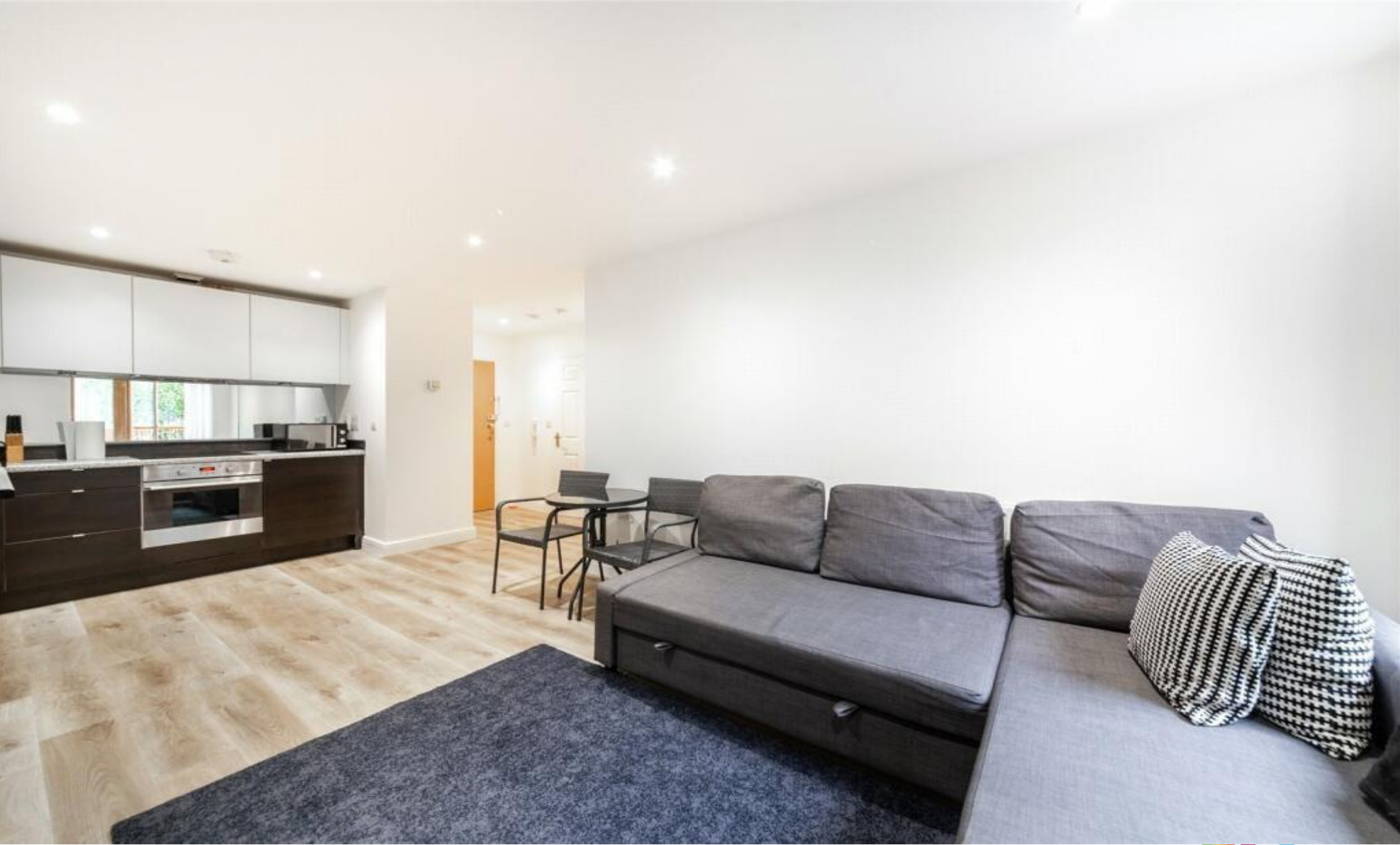
Bath House, Arboretum Place, Barking, IG11 7PS