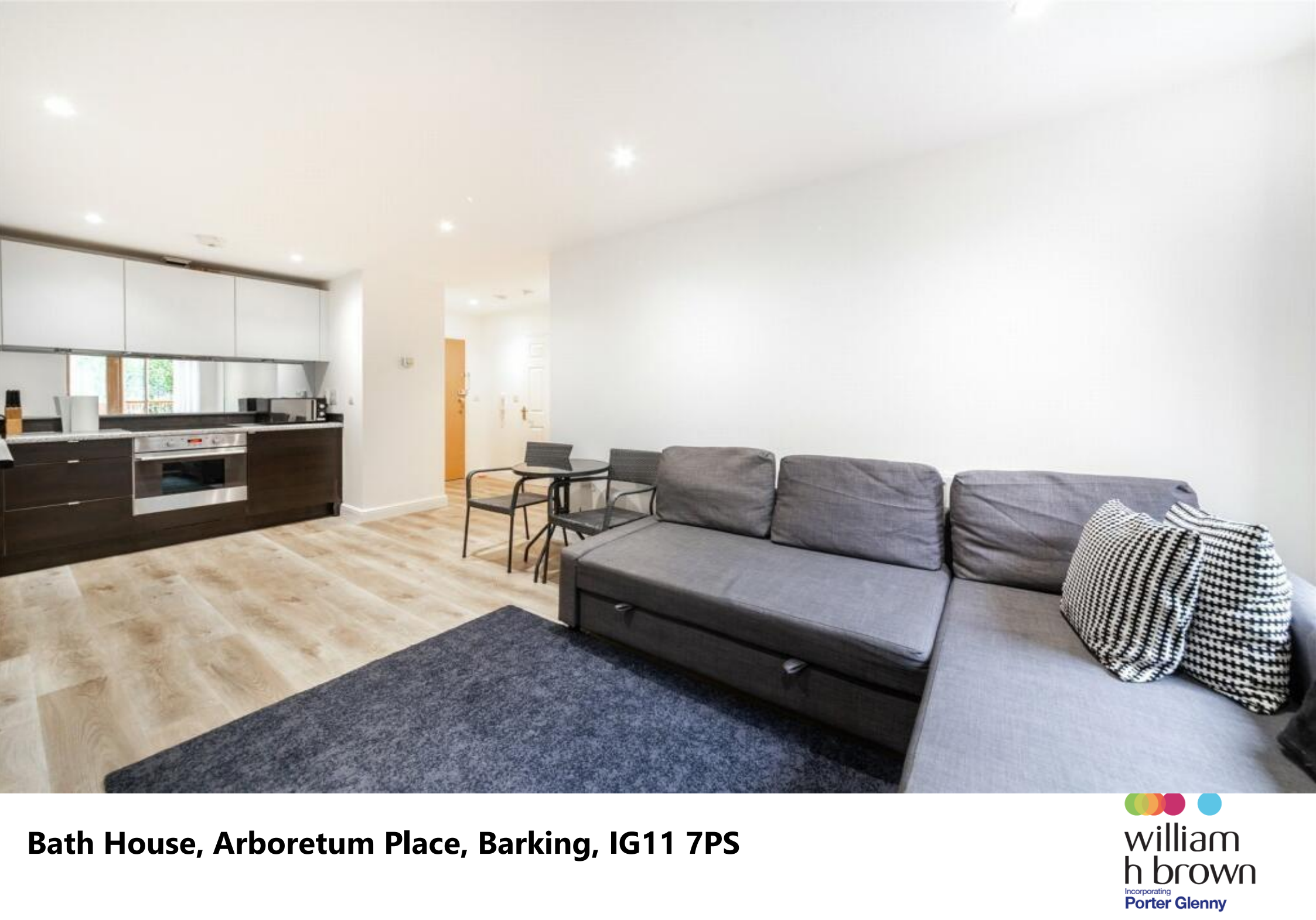
Bath House, Arboretum Place, Barking, IG11 7PS