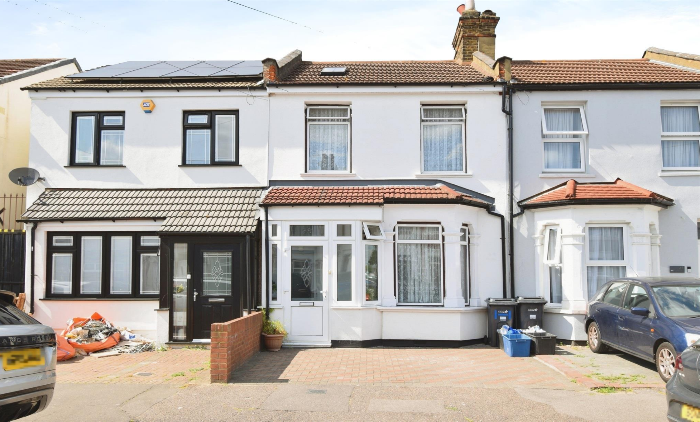
Kingston Road, Ilford, IG1 1PB